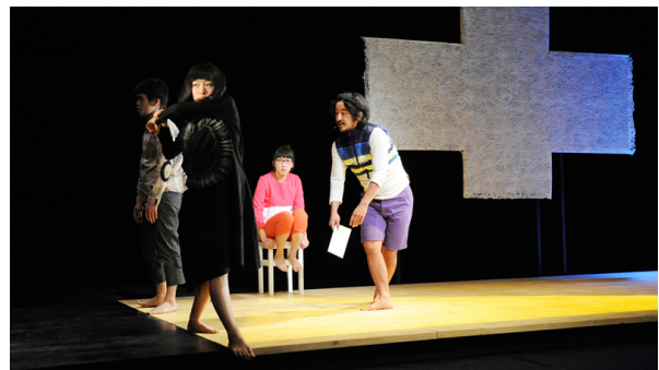
Chelfitsch. Grand and Floor

of Nō, including, for example, the character of a ghost. The play also adopts some of Nō's distinctive design and staging conventions. Okada's interest in referencing Nō was also present in early works including The Sonic Life of a Giant Tortoise (Zōgame no Sonikku Raifu, 2011). 18 The reference in that case was oblique, while here it is direct and explicit and was acknowledged by Okada in post-performance discussions.