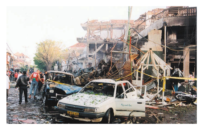
A Bali nightclub bombed in 2002

Bangkok emerged as the American military's "Rest and Recreation" destination of choice. Still, Thailand was then only attracting some 200,000 tourists a year with the figure for Cambodia at some 60,000 before 1970 when war closed in. But, as tourism massified with cheap air travel in the 1980s, countries such as Thailand and Indonesia began to cash in, upgrading infrastructure, offering visas upon arrival and other incentives. Mass tourism had arrived drawing in visitors in the millions. Westerners were soon joined by Japanese and other Asian travelers, including those from the rising middle classes of the Asian Newly Industrialized Economies. Today they are being joined by perhaps the largest wave of touristtravelers to descend upon the region, those from China.