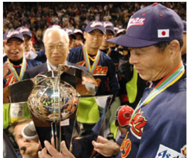
Sadaharu Oh at WBC 2006

Indeed, the smooth, much-praised performance of Team Japan in WBC 2006, an event that was widely watched in Japan, caused many Japanese baseball experts to conclude that after all, their way was best. The manager of Team Japan was none other than the aforementioned Oh, a man whose name was synonymous with backbreaking workouts during a storied career in which he hit 868 home runs.