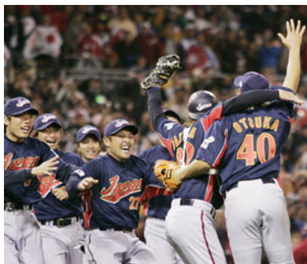
The Japanese team after winning WBC 2006

season-hits record, while spurring an influx of tourists from Japan that has brought millions of dollars into the Northwest area economy. Matsui has become a popular, reliable fixture in the New York Yankees outfield, while Tadahito Iguchi played such an important role on the 2005 World Champion Chicago White Sox squad that his manager Ozzie Guillen called him the real MVP of the team. The subsequent emergence of an enormous new market for Mariner, Yankee and White Sox telecasts in Japan has also helped. At the end of the 2003 season, Major League Baseball (MLB) signed a record $275-million TV contract with the giant Japanese advertising firm Dentsu, and then sent the Yankees and the Tampa Devil Rays to play an opening-day game in Tokyo in 2004. Moreover, the MLB and the Major League Baseball Players Association (MLBPA) enthusiastically promoted the establishment of the World Baseball Classic (WBC), a quadrennial tournament that debuted in March 2006, featuring national teams from 16 countries—with American organizers going to extraordinary lengths to coax an initially reluctant Japan to join in. All in all, that represents quite a transformation.