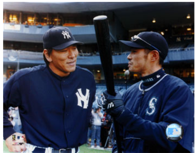
Hideki Matsui and Ichiro Suzuki

The success of players like Ichiro Suzuki and Hideki Matsui in the United States has once again demonstrated the power of sport in crossing national borders. With their stirring performances on America’s baseball diamonds, these imported players have helped to create vast new markets for Major League baseball in Japan, while teaching Americans that there is a new and very different way to approach their own national pastime. More importantly, the accomplishments of these athletes have served to influence the way many Americans and Japanese look at each other, and raised anew questions about the role of culture in sport.