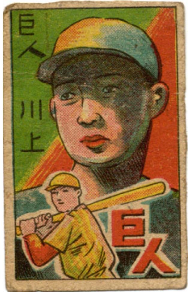
Tetsuharu Kawakami baseball card

samurai'—and rather more like definitions of effort familiar to athletes in the United States and elsewhere. [20]