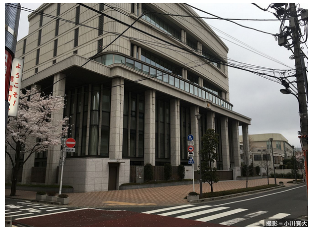
Streets around Soka Gakkai’s Hall of the Great Vow of Kōsen Rufu remain empty after it closes its headquarters in Shinanomachi, Tokyo.