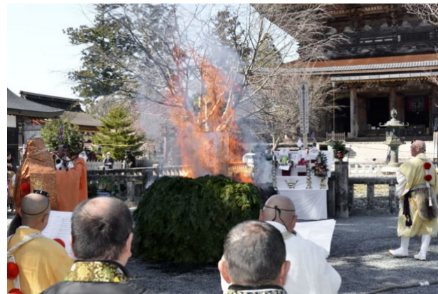
Shugendō ascetics gather on 6 March 2020 at the daikitōe (great prayer assembly) at the temple Kinpusenji to ritually expunge COVID-19.

challenging bodily austerities, secret teachings and initiations, and other distinctive elements for worship at remote mountain sites. Major Shugendō affiliate temples have been responding to the pandemic in ancient ways. For example, the Shingon temple Daigoji in Kyoto on April 15 dedicated the centerpiece of its three-week-long sakurae (cherry blossom assembly), a goma kuyō (fire pūjā ) and performance of kyōgen (comic ritual plays), to eliminating the disease. 31 Another goma kuyō was performed at noon daily at the Shugendō-affiliate temple Kinpusenji in Nara's Yoshino district to drive away the virus. On March 6, fifty shugenja (Shugendō renunciants) gathered at a daikitōe , a "great prayer assembly," a goma kuyō put on jointly by Kinpusenji and the temple Ōminesanji. This was the first ritual collaboration between these sites since they were separated in the Meiji era (1868-1912). 32 The event was broadcast over social media and received hundreds of supportive messages. 33