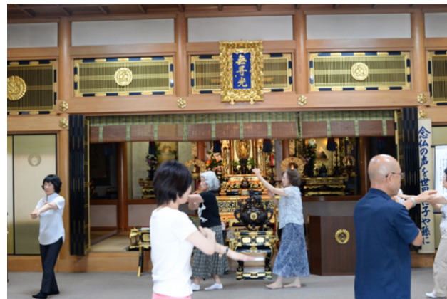
Members of the Rengekai (Lotus Association), the monthly women's meeting at the Jōdo Shinshū temple Tenshinji in Chiba prefecture, practice the obon dance for the summer festival in 2015. Countless local-level gatherings like this are on hold during the coronavirus crisis.

Religion in Japan, as it is elsewhere, tends to be intensely social. For the devout, life consists of frequent in-person meetings. In religious gatherings of all types, believers depend on inspiration from one another. Their sense of self relies on group activities, and the survival of religious groups relies on solidarity their participants cultivate through interpersonal bonds. Prolonged social distancing may exact a toll on Japan's religions. It remains to be seen how isolation will exacerbate differences between internal constituencies and how it will affect parishioners' desire to return to regular participation.