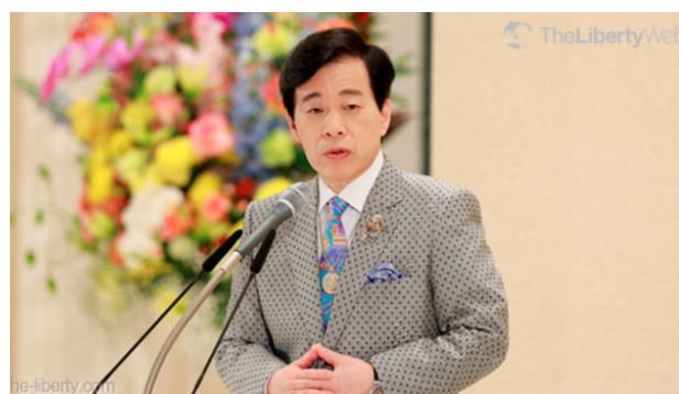
Happy Science founder Ōkawa Ryūhō addresses followers in Sendai on 14 March 2020.

Cantare, along with other beings, Ōkawa highlighted messages he received about coronavirus as an existential threat to Japan. 19 Happy Science caught media attention for defiantly gathering large numbers of members just as other New Religions closed down; Ōkawa addressed approximately 1300 followers and guests in Kagawa prefecture on February 22 and 1200 in Miyagi prefecture on March 14. In his speeches and in the religion's publications, the spiritual leader advanced Happy Science's rightwing Japanese political agenda as it advertised his signature ritual practice as the most effective means of eliminating the disease. 20 "This infection is made in China," Ōkawa announced. "To combat a godless communist dictatorship that is spreading sorcery across the world to oppress human rights and exert its hegemony, I am thinking of a divine protection. Services at our branches and Viharas ( shōja ) focus primarily on watching and listening to videos of dharma talks and praying. We are not curtailing these services, but we are taking sufficient precautions by using alcohol-based disinfectant and monitoring health conditions." 21