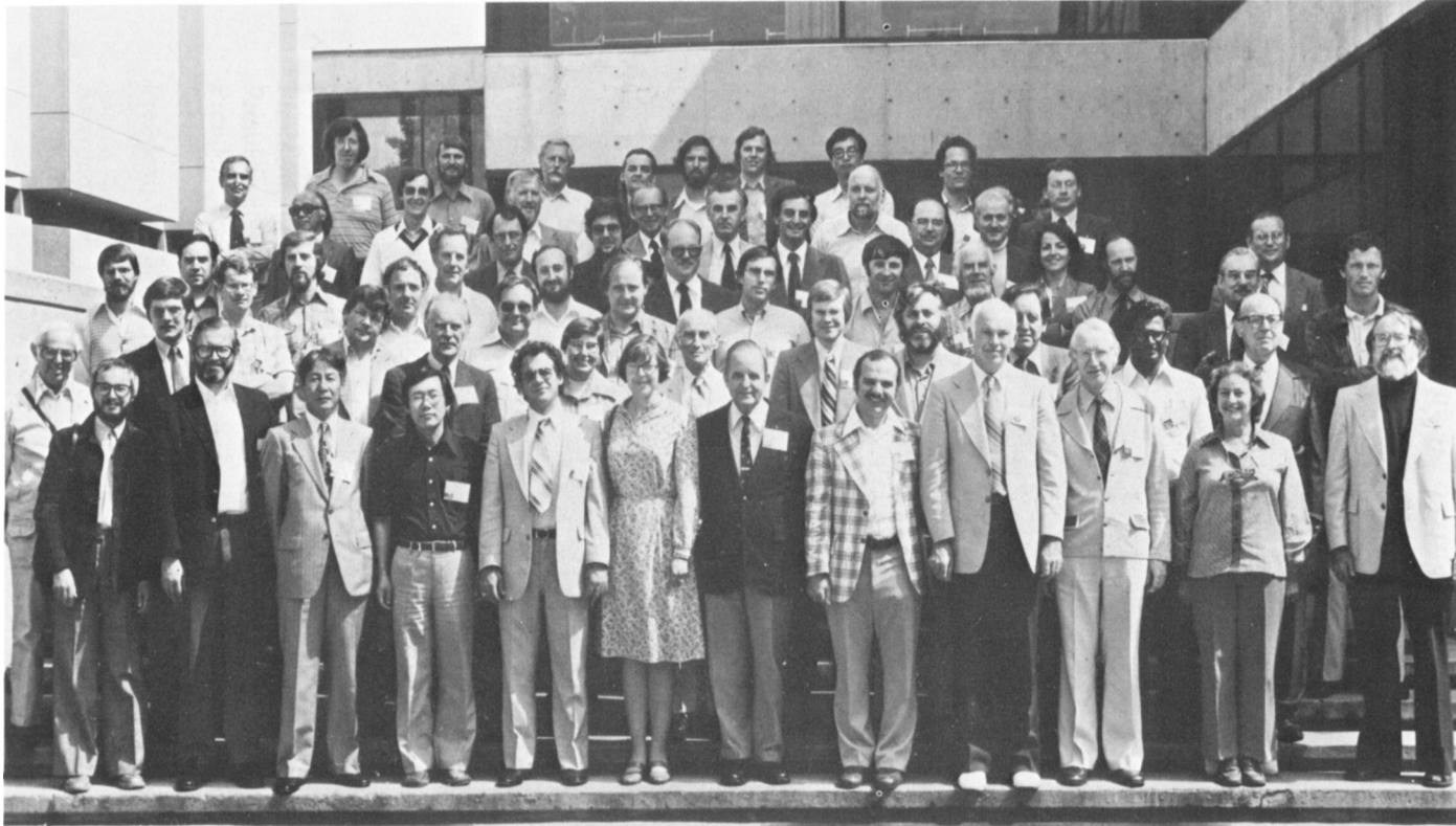
PARTICIPANTS OF THE SYMPOSIUM (See photo key and list of participants)