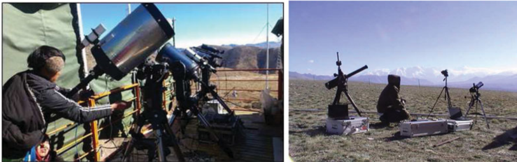
Figure 2. Professional site survey instruments after critical calibrations are used for the solar site survey.