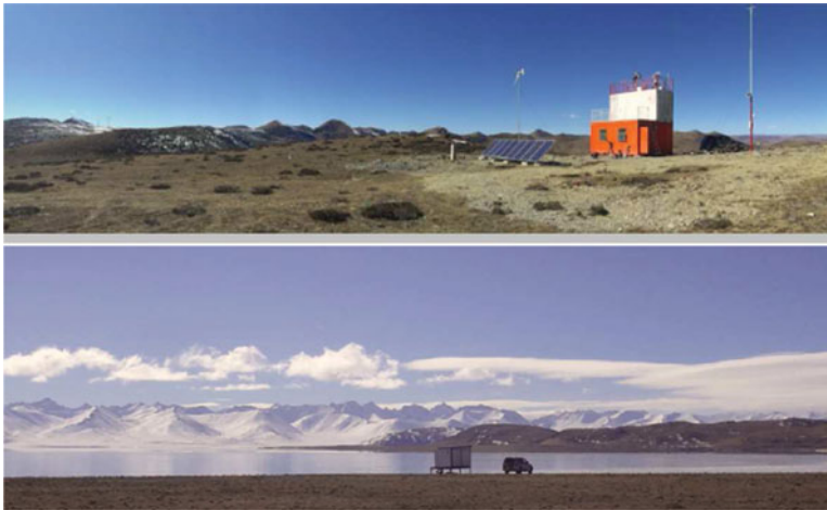
Figure 1. Top: The WMS (Daocheng) monitoring station located in western Sichuan. Bottom: The Namco monitoring station located in Tibet.