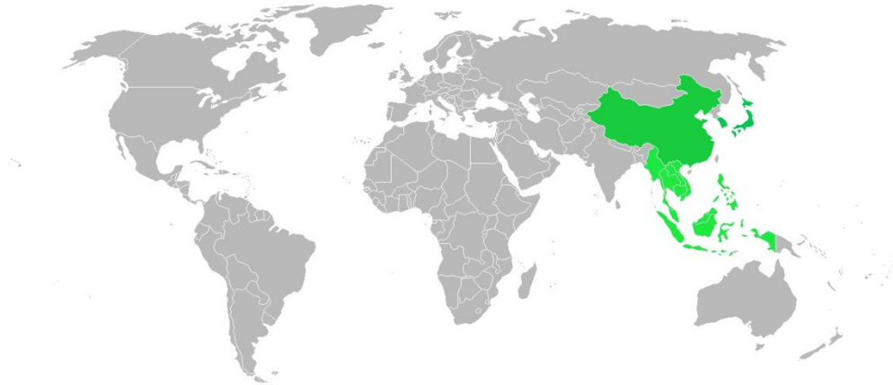
Map of ASEAN +3

hope to create an East Asian Community (Kyodotai) for peace, prosperity and progress.” ASEAN leaders supported that dream-like concept and in 2005 an East Asia Summit was held. However, Japan and China were in conflict about who should participate. The US, which was not invited, was dissatisfied, so the process has not been proceeding smoothly.