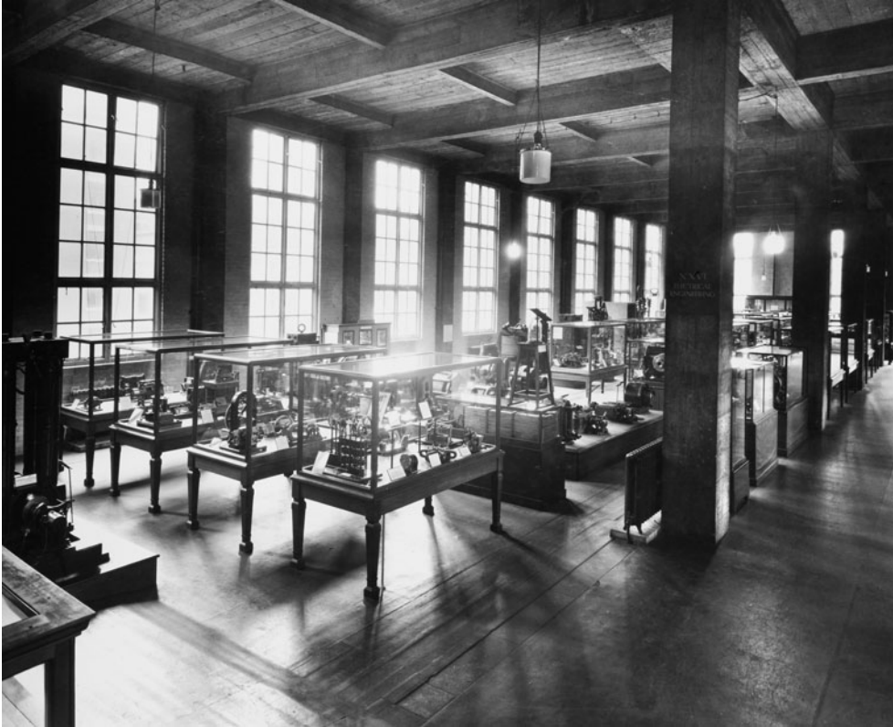
Figure 2. The Science Museum's Electrical Engineering Gallery in 1937, embodying the developmental display model.

purpose, and then uses Bell's headings to structure its exegesis (although, for the sake of clarity, I do not follow this sequence here).