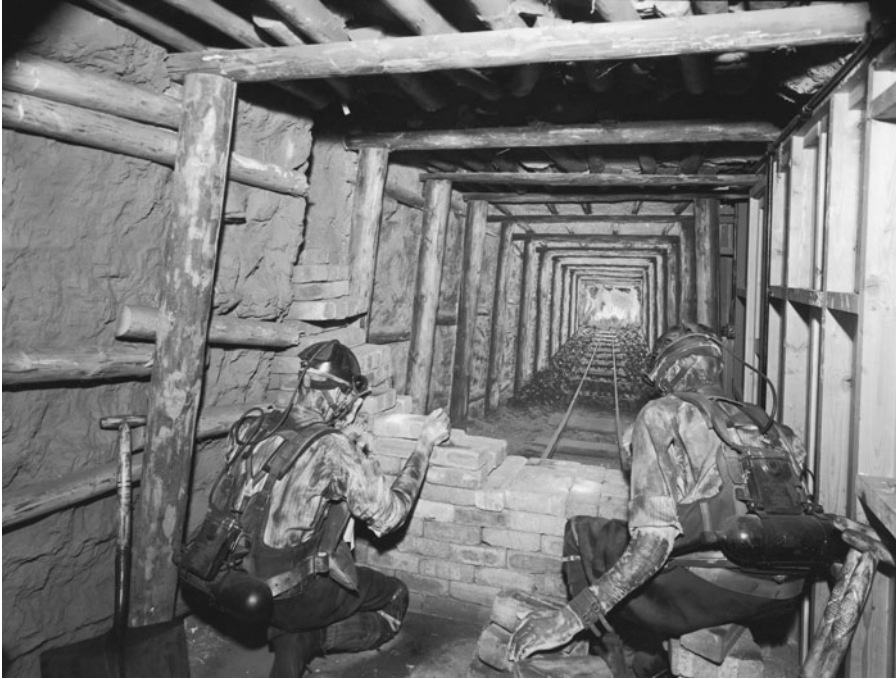
Figure 5. ‘Sealing Up Fire’, full-size reconstruction in the museum’s new mining display, 1952, one of Sherwood Taylor’s favoured, more vivid, kinds of display for general audiences.

I cannot conclude without addressing the fate of his two major historical propositions. With regard to the formation of reserve collections, by the time of the publication of the 1952 policy, Sherwood Taylor’s principled preference for such collections had converged with the brute reality that the museum was forced to store approximately 50 per cent of the collection off site. 106 This was because the building of the museum’s Centre Block had required the demolition of existing galleries. 107 The preference for displaying fewer objects in more ‘pleasing and intelligible’ displays was also having an effect. In other words, a ‘reserve’ was becoming business as usual. But the idealism that the reserve should be a recourse for interested visitors has never gone away; in fact it is resurgent at the time of writing with the establishment of the Science Museum Group’s National Collections Centre in Wiltshire, when the reserve amounts to perhaps 95 per cent of the whole. It is also present in the aspirations of the AHRC’s Towards a National Collection initiative, which aims to make the nation’s collections fully accessible to anyone who would research them via their digital records. 108 In both cases we have somewhat dissolved the binary between expert and general publics, reflecting the recognition of lay expertise and more participative models of access.