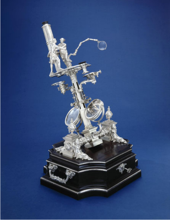
Figure 3. Silver 'universal double microscope' with ornate decoration by George Adams the Elder, Fleet Street, London, c.1763, the kind of beautiful object that museum visitors would want to see, according to Sherwood Taylor.