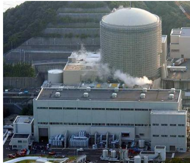
Steam billows from the Mihama nuclear power plant in a 2004 accident

The world has had to live for more than sixty years with the serious threat of nuclear devastation, a threat that is the result of the huge number of nuclear weapons that could destroy the earth several times over. Even as this danger continues, we also face rising nuclear proliferation threats caused by the diversion of peaceful nuclear programs to military use and withdrawals from international non-proliferation treaties and agreements, as well as the threats of nuclear terrorism and thefts of or illicit trade in nuclear materials by non-state actors.