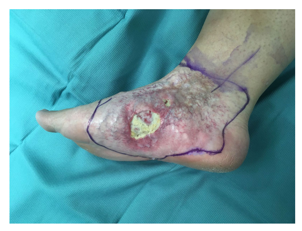
Figure 1. Aspect of the foot before treatment. Note the ulceration on the internal aspect, secondary to the arterio-venous malformation.