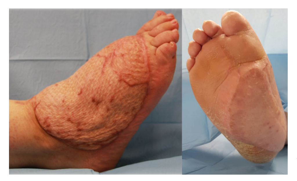
Figure 3. Result 2 years after completion of treatment. Note the two free flaps in place with an adequate aspect of the reconstructed foot and no signs of recurrence.