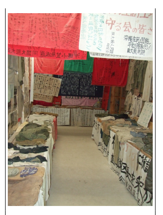
Protest banners written by Iejima villagers

The reception of the authorities stood in stark contrast to the hospitality encountered from ordinary people. Both Okinawan politicians and intellectuals alike ignored Iejima's farmers' pleas for assistance. When the islanders confronted the U.S. High Commission, General James Moore played the Red card, proclaiming that the farmers were uneducated dupes who were being manipulated by communist agitators. An Air Force spokesman called the problem "a petty dispute" - inconsequential in light of the practice bombings which ensured security "both for the Free World and for [Okinawan] people."