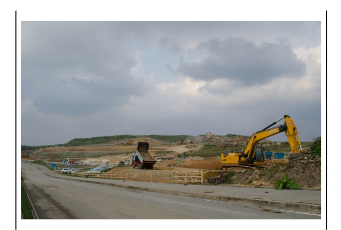
Yonaguni SDF Base Construction Works, December 2014

If this project were to proceed, soldiers would march in at the beginning of 2016. If that happened, it would be the first new military base to be constructed in Okinawa since reversion to Japan in 1972 and since "interoperability" is the principle regularly invoked in recent exchanges between Japan and the United States, the fact of its being "Japanese" would likely be nominal only.