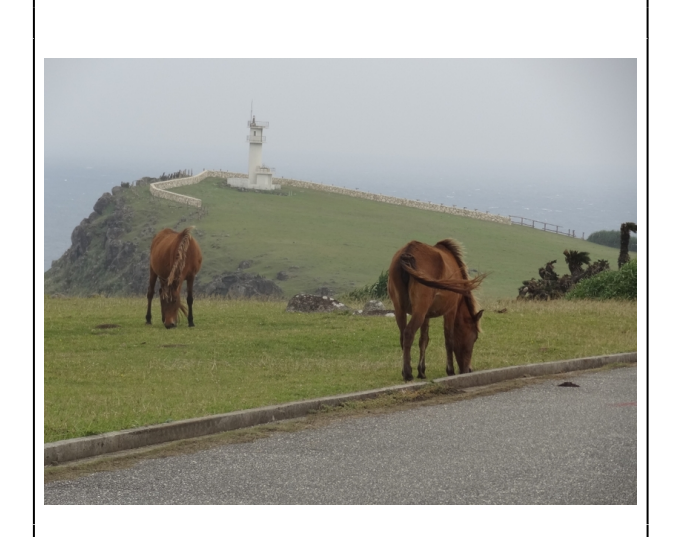
Yonaguni, Adjacent to the Base Site, 2011

held in the other Japanese SDF services (Air and Maritime) that the real reasons on the part of the GSDF for deployment to Yonaguni were "turf" considerations, to compensate for the loss of role in Hokkaido where, through the Cold War, they prepared for a putative land attack by Soviet forces. 62 In the post-Cold War, post-War on Terror era, the South-West was clearly the growth area for Japan's military, and both Air and Maritime forces had already assured themselves of a major role. Yonaguni was the Ground force's chance. A similar move into the much larger Ishigaki Island, where the newly re-elected conservative mayor is known to be supportive of such stationing and also welcoming of Maritime SDF visits, was also expected to follow shortly.<sup>63</sup>