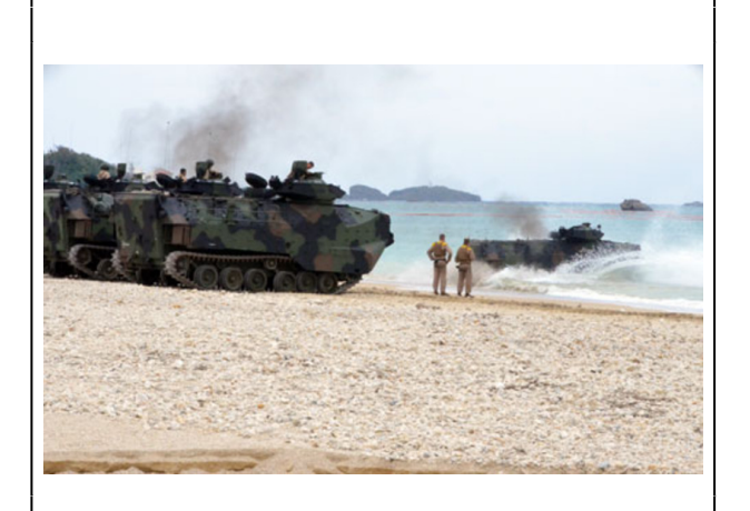
US amphibious vehicles take to the sea at Henoko, 9:45 am on 8 December 2014

Henoko, the hamlet chosen for this project, happens to be one of the most bio-diverse and spectacularly beautiful coastal zones in all Japan, one that its Ministry of the Environment wants to promote as a UNESCO World Heritage Site. It hosts a cornucopia of life forms from blue—and many other species of—coral (with the countless microorganisms to which they are host) through crustaceans, sea cucumbers and seaweeds and hundreds of species of shrimp, snail, fish, tortoise, snake and mammal. Many are rare or endangered, and strictly protected, none more so than the critically endangered dugong.