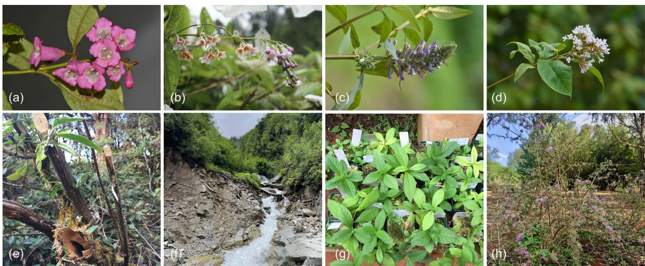
PLATE 1 (a) Buddleja colvillei , (b) Buddleja sessilifolia , (c) Buddleja delavayi , (d) Buddleja yunnanensis , (e) mature B. colvillei cut down in Ilam, Nepal, (f) loss of habitat of B. sessilifolia caused by debris flow and mudslides in the Gaoligong Mountains, Yunnan, China, (g) B. sessilifolia plantlets in Kunming Botanical Garden, and (h) living collection of B. delavayi in Kunming Botanical Garden.

Our study area encompasses the trans-Himalayan region, spanning the eastern Himalayas to south-western China (Fig. 1), including eastern Nepal and western China (Yunnan and Tibet). We first collected species occurrence records from the Flora of China (Li & Leeuwenberg, 1996), Herbarium KUN at the Kunming Institute of Botany, Chinese Academy of Sciences, the Chinese Virtual Herbarium (2023), GBIF (2023) and iPlant (2023). Using the distribution information from these sources we selected 12 locations that together represent almost all known sites of the four species. We conducted field studies over 13 years (2010–2022) to obtain comprehensive data on the four species, following the recommendations for field investigations of Plant Species with Extremely Small Populations (Yang & Sun, 2017; Yang et al., 2020). Our field study did not include the populations of B. colvillei in Bhutan and India, mainly because of geographical barriers and feasibility constraints.