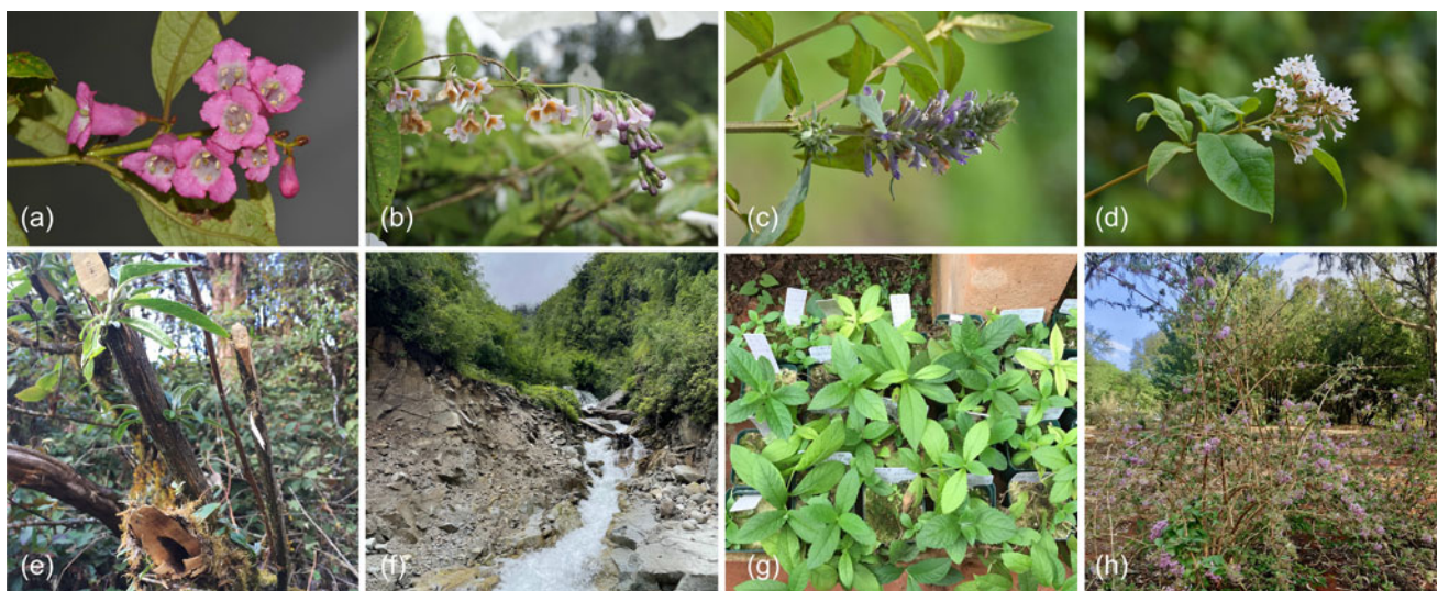
PLATE 1 (a) Buddleja colvilei , (b) Buddleja sessilifolia , (c) Buddleja delavayi , (d) Buddleja yunnanensis , (e) mature B. colvilei cut down in Ilam, Nepal, (f) loss of habitat of B. sessilifolia caused by debris flow and mudslides in the Gaoligong Mountains, Yunnan, China, (g) B. sessilifolia plantlets in Kunming Botanical Garden, and (h) living collection of B. delavayi in Kunming Botanical Garden.

Our study area encompasses the trans-Himalayan region, spanning the eastern Himalayas to south-western China (Fig. 1), including eastern Nepal and western China (Yunnan and Tibet). We first collected species occurrence records from the Flora of China (Li & Leeuwenberg, 1996), Herbarium KUN at the Kunming Institute of Botany, Chinese Academy of Sciences, the Chinese Virtual Herbarium (2023), GBIF (2023) and iPlant (2023). Using the distribution information from these sources we selected 12 locations that together represent almost all known sites of the four species. We conducted field studies over 13 years (2010–2022) to obtain comprehensive data on the four species, following the recommendations for field investigations of Plant Species with Extremely Small Populations (Yang & Sun, 2017; Yang et al., 2020). Our field study did not include the populations of B. colvilei in Bhutan and India, mainly because of geographical barriers and feasibility constraints.