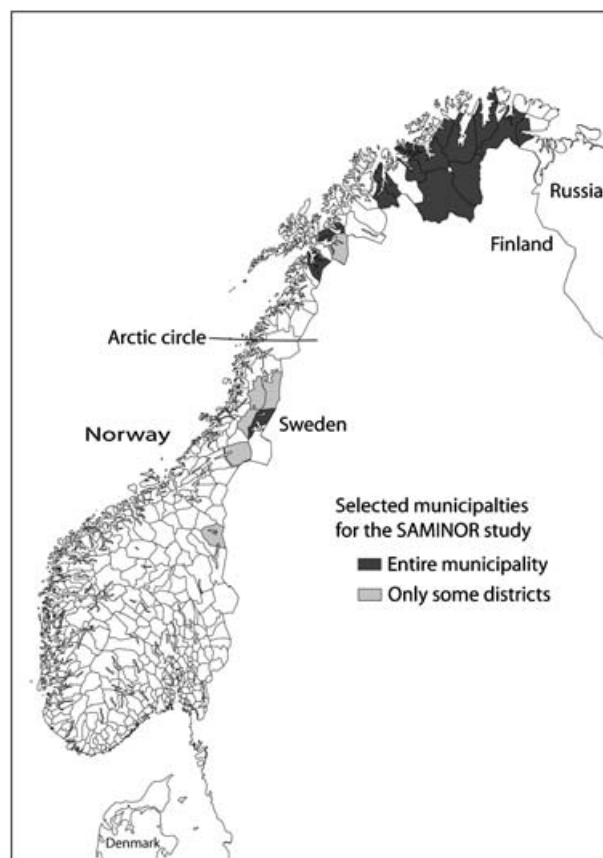
Fig. 1 Municipalities investigated in the SAMINOR study. Finnmark county: Karasjok, Kautokeino, Porsanger, Tana, Nesseby, Lebesby, Alta, Loppa, Kvalsund. Troms county: Kåfjord, Kvænangen, Storfjord, Lyngen, Skånland og Lavan-gen. Nordland county: Tysfjord, Evenes and parts of Hattfjell-dal, Grane and Narvik. Nord Trøndelag county: Røyrvik and parts of Namskogan and Snåsa. Sør Trøndelag county: part of Røros

The SAMINOR study was conducted in geographical areas of Norway with a mixed Sámi/Norwegian population. The study intended to cover all municipalities in Norway where more than 5–10% of the population reported themselves as Sámi in the 1970 census 17 , based on the definition of Sámi as a person with at least one grandparent with Sámi as the spoken home language. In addition, some selected districts were included from