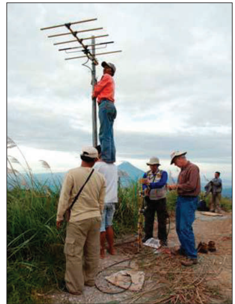
Figure 25.6 VDAP and CVGHM scientists install a seismic station to monitor volcanic activity in North Sulawesi.

CVGHM and VDAP built what is now one of the best monitoring networks in the country, with real-time seismic monitoring of the 10 active volcanoes in place and signals relayed in real-time by satellite and internet to CVGHM offices in Bandung. In 2006,