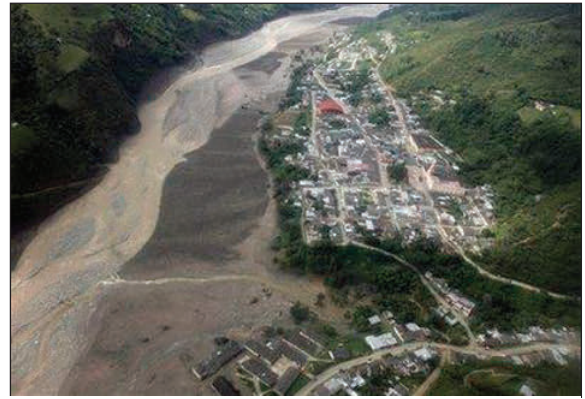
Figure 25.5 Eruption-generated debris flow overran portions the town of Belalcazar, Colombia approximately 15 miles downstream of Huila volcano on 20 November 2008. Accurate forecasts and warnings triggered evacuation of the 4000 residents, saving lives and property.

In 2008 a Memorandum of Understanding between the USGS and INGEOMINAS was signed, and subsequently the Director of INGEOMINAS has sought a Project Annex with VDAP to work with them to develop their volcano monitoring and analysis capabilities on all 15 Colombian volcanoes. Within the limitations of its resources, VDAP will continue to work with INGEOMINAS on volcano hazard mitigation in this important South American country.