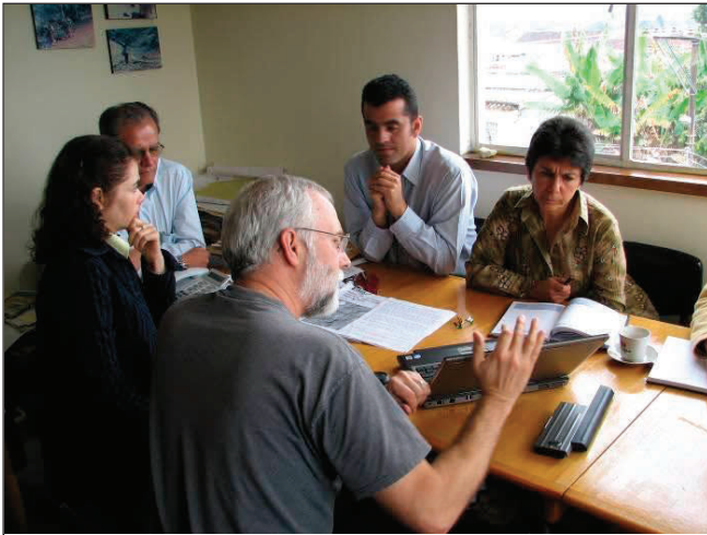
Figure 25.4 USGS and INGEOMINAS personnel meet to define alert level system for Huila volcano, Colombia. February 2007.