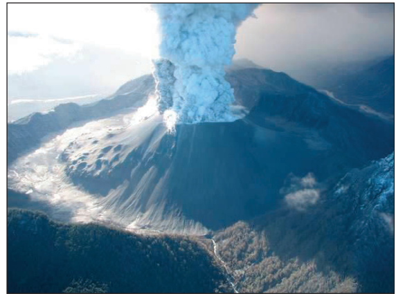
Figure 25.2 Gas, ash, and steam erupt from the growing lava dome in the crater of Chaitén, southern Chile, May 26, 2008.

On 2 May, 2008, Chaitén volcano in southern Chile suddenly re-activated after hundreds of years of dormancy and produced the largest eruption so far in the twenty-first century. A town of more than 4,000 people lying just 10 km from the volcano had to be evacuated within 48 hours of the eruption onset. A VDAP rapid-response team assisted the Chilean Servicio Nacional de Geología y Minería (SERNAGEOMIN) to deploy radio-telemetered monitoring instruments and forecast eruption hazards. Added to the disruption of lives and livelihoods on the ground, the Chaitén eruption severely disrupted air traffic in the region. In addition to the VDAP response, two experts on volcanic ash hazards to aviation from the USGS Volcano Hazards Program traveled to Argentina and Chile to advise civilian and military aviation interests on procedures to ensure safe operations during eruptions in the region. Although not widely known prior to the Iceland eruptions of 2010, volcanic ash clouds threaten aircraft daily on a global basis and planes must be warned away from ash-contaminated airspace. Since the near-crash of several fully loaded 747s in the 1980s, the USGS, FAA and NOAA have been leaders in developing a global ash avoidance programme under the auspices of the International Civil Aviation Organization.