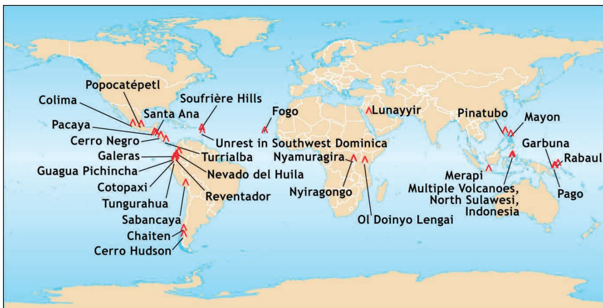
Figure 25.1 Map of VDAP deployments 1986-2012.