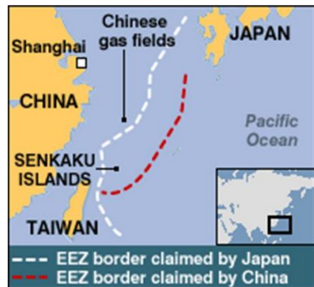
East China Sea map

in the East China Sea through the conclusion of a bilateral treaty (2). As of now no round of negotiation has yet begun which gives an indication of the magnitude of problems.