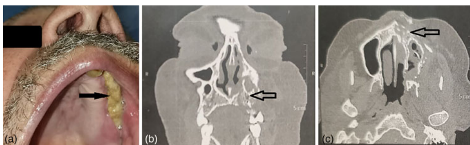
Figure 1. A: Osteomyelitis and sequestrum in the right side of the palate (arrow). B, C: Coronal and axial CT scan of the same patient showing osteomyelitis (arrows).

We utilised external approaches in 23 patients. After multidisciplinary consultations of ophthalmology, neurosurgery, and maxillofacial surgery, we performed orbital exenteration in 13 patients (21.7 per cent), palatotomy and/or maxillectomy in 11 patients (18.3 per cent), debridement and sequestrectomy for frontal sinus osteomyelitis in 2 cases (3.3 per cent), skin debridement in 2 cases, and craniotomy for evacuation of a brain abscess in 1 patient.