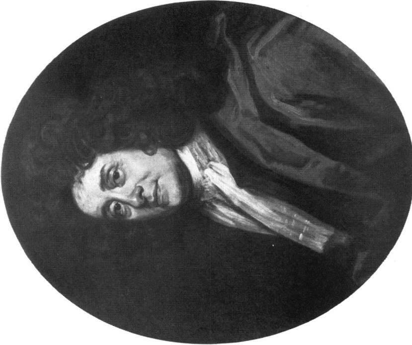
Figure 4. Hew Broun, by Sir John Medina. Canvas, 77 by 65.3 cm.