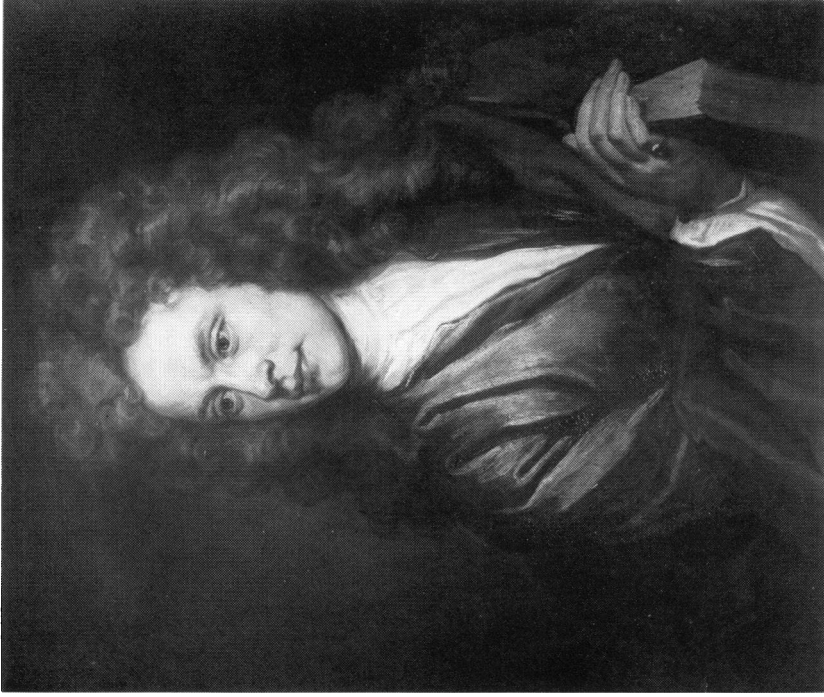
Figure 10. Sir John Clerk of Pentuik, by Sir John Medina, 1700/01. Canvas, 77 by 64 cm. (Clerk Collection, Pentuik).