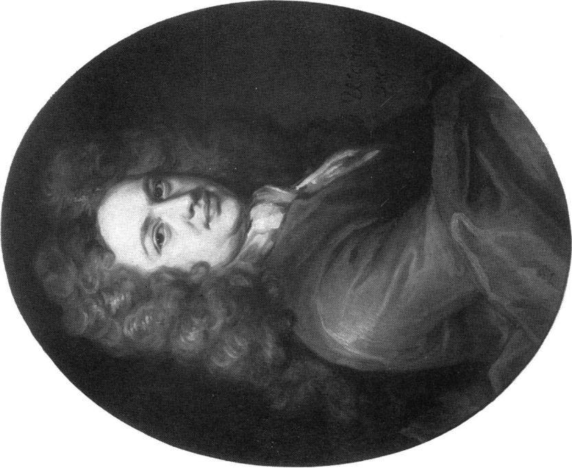
Figure 13. Walter Potter, by Sir John Medina. Canvas, 77 by 65.4 cm.