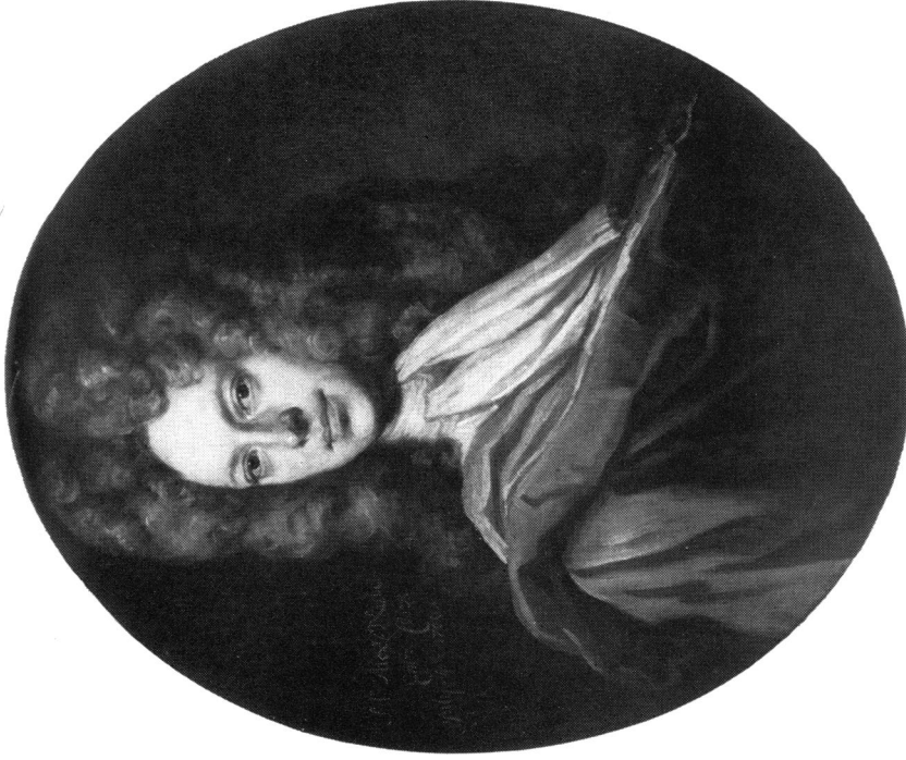
Figure 16. Alexander Nisbet, by Sir John Medina and an assistant. Canvas, 77.5 by 66.6 cm.