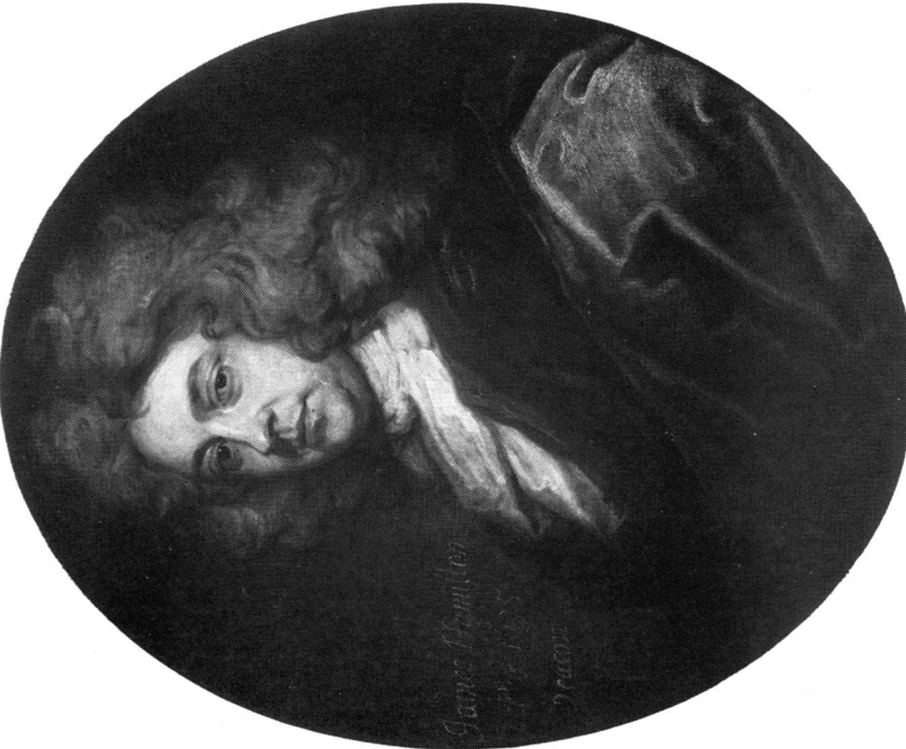
Figure 9. James Hamilton, by Sir John Medina. Canvas, 77.5 by 64.7 cm.