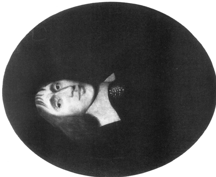
Figure 3. James Borthwick of Stow, by an unknown artist, c. 1655. Canvas, 77 by 65.3 cm.