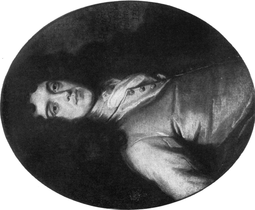
Figure 11. Henry Hamilton, by Sir John Medina. Canvas, 77 by 65.4 cm.