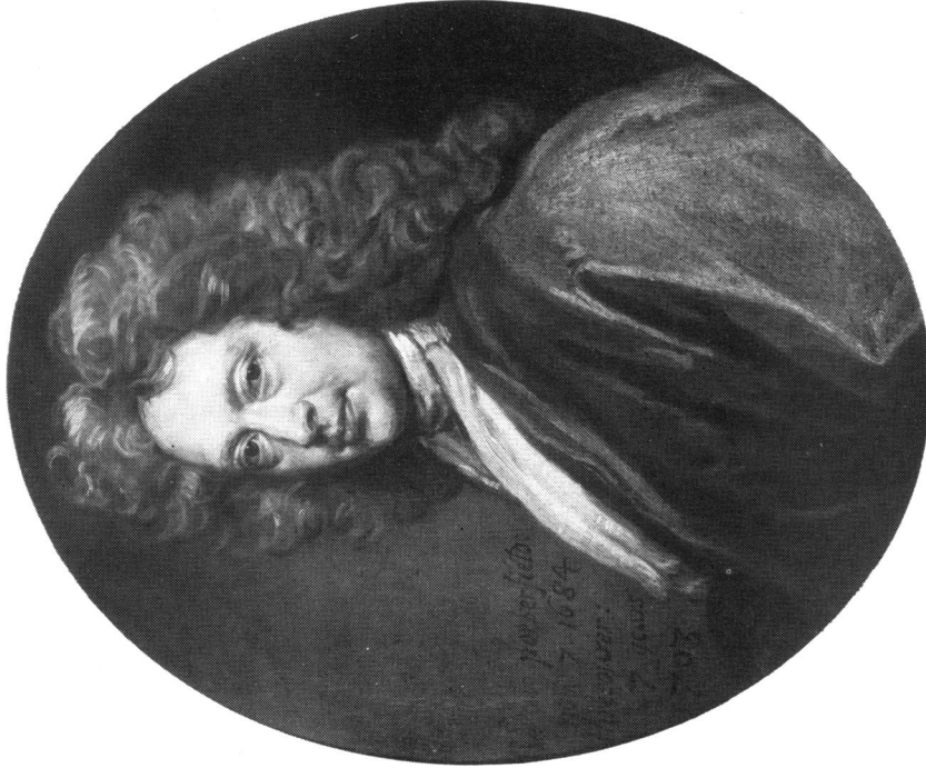
Figure 8. Walter Porterfield, by Sir John Medina. Canvas, 77 by 66 cm.