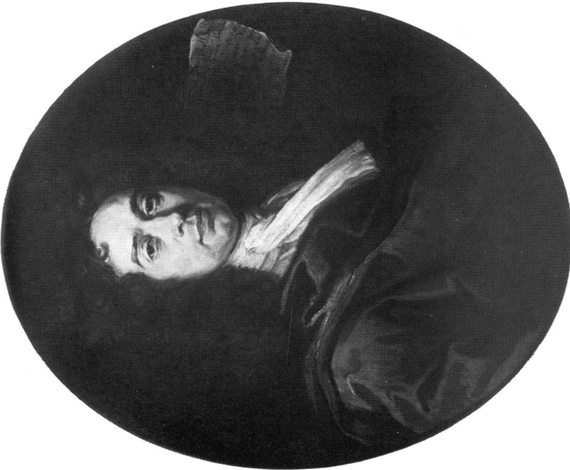
Figure 1. Self-portrait by Sir John Medina, 1708. Canvas, 77 by 64 cm, (This, and all the following portraits, except Fig. 10, are in the Royal College of Surgeons, Edinburgh.)