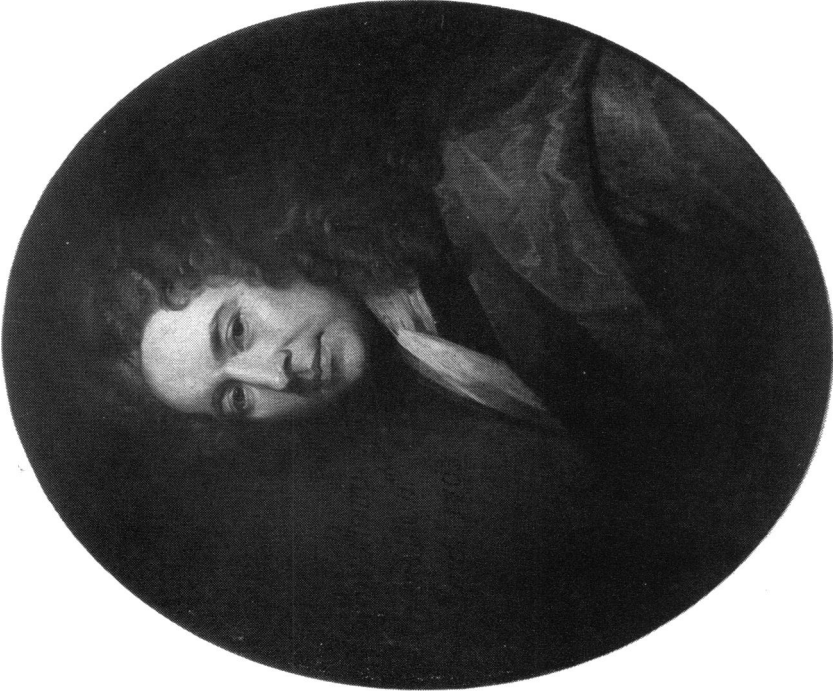
Figure 14. John Monro, by William Aikman. Signed and dated 1715. Canvas, 77 by 65.4 cm.