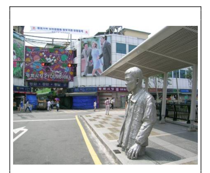
Statue of Chun Tae-il standing on the bridge in front of the P'yŏnghwa market

In the opening ceremony on September 30, 2005, two days before the inception of the new stream, while labor activists reminded people that Chun's struggle is not over but continues in the present, 26 officials stressed that the statue is a universal symbol of love, life and peacemaking. The gesture of peace and reconciliation suggested closure with respect to the inhumanities of the exploitative modernization and a beginning of the new economy symbolized in the restoration of the stream. It however concealed the violence accompanied by gentrification, a major part of the stream restoration.