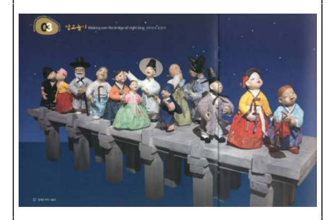
Exhibit displayed in the Cheonggye Museum shows a scene of people gathering together on the bridge during the Chosŏn period

In the programmatic design of the Cheonggye stream, history was naturalized. The flow of the past goes nowhere other than to the present which contains it. The Chosŏn dynasty symbolizes the eternal Korea and remains the spiritual guidance for the development of the city. In this scenario, visitors are framed as subjects of the Chosŏn era and asked to reenact the activities of their fellows of the past hundred years.