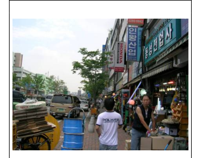
The Cheonggye area is still packed with 1970s buildings and a market selling a variety of wholesale and retail goods

the stream restoration committee, appear unspectacular. However, this area, which used to hold hundreds of manufacturing workshops and stores, embodies the earlier symbol of Korean modernization. Together with the Samil building and the Samil expressway, they are the signifiers of the earlier state modernization. Tensions arise on how to integrate these earlier symbols of industrial development into the spectacle of the present. The restored stream, in any case, runs through this section of the city and efforts had to be made to incorporate this zone into the narrative of the present.