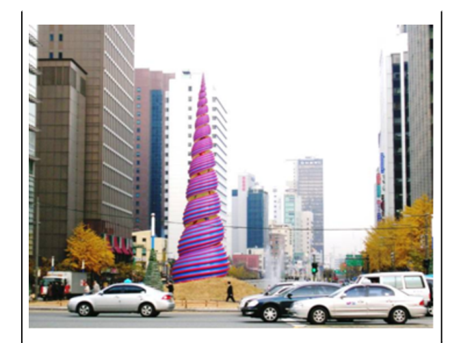
Spring, installation work by Claes Oldenburg, standing at the Cheonggye plaza

The heart of the Cheonggye stream is located at its west end in the financial districts lined with modernist corporate skyscrapers. Such designation registers the idea that the city features the development of its financial service industries. The Cheonggye stream, however, expresses itself in a rather unique way. It makes its image visually different from the faceless modernist façade. In September 2006 at the open space called the Cheonggye plaza designed to hold various kinds of public festivities, a 20-meter-high object named Spring was erected in the shape of a marsh snail colored in bright blue and red.