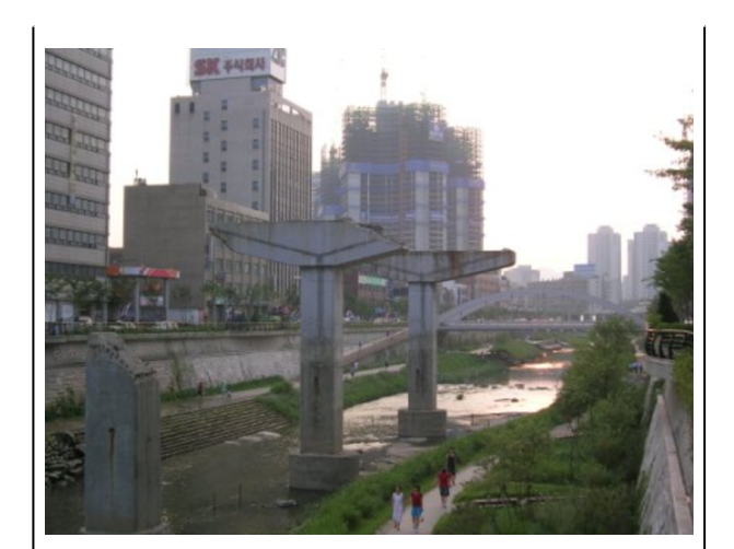
Two remaining pillars of the Samil expressway overpass displayed in the middle of the Cheonggye stream

The east end today is undergoing major urban gentrification. The surrounding areas, which used to be occupied by buildings from the 1970s and houses for the poor, are being cleared to make space for the construction of new commercial and residential buildings to be occupied by affluent residents. In one of the construction sites, big billboards were set up to attract potential buyers of the properties. The major selling point is the image of a new town located close to the "natural" environment of the new stream. The gentrification employs the rationale that to achieve international competitiveness, the old manufacturing and other less competitive sectors and the working class residential neighborhood ought to be relocated to support new high-tech and financial industries. In spite of fierce resistance especially from sidewalk vendors, the city government successfully cleared the area by force. The critical voices of the evictees were almost lost in the celebration of the new stream and the promise for better life in future. The east end, planned to be an upscale residential area, is thus coordinated to complement the west end which was designated as a "world class business centre." Joined by the stream,