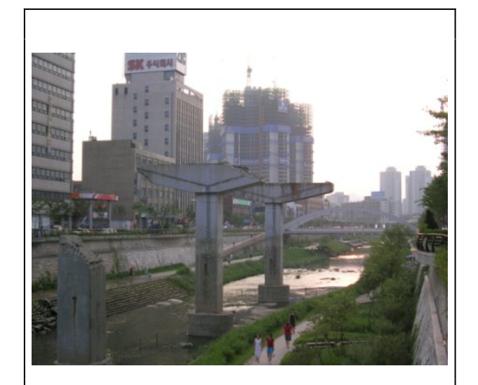
Samil building built in 1970. (Seoul, Twentieth century: A photographical History of the Last 100 Years, Seoul: Seoul Development Institute, 2000.)

marker of social and political boundaries, though the hierarchy of social space was reversed: the north of the stream inhabited by the colonized and the south by the colonizer. This spatial division was symbolically revised in 1926 when the colonial government built the Government General building at the site of the former royal palace located north of the stream. The new mark of authority was followed by initiatives to redesign the city. In the 1930s, a plan was proposed to redevelop the stream area by covering it up and constructing a street. The plan, not at the time implemented, was taken over by the postcolonial Korea government as it paved the stream with cement (1958-1979) and built an overpass above it (1967-1971). The urban project to construct a new Seoul, led by the appointed mayor of Seoul, Kim Hyŏn-ok (1966-1971), nicknamed "bulldozer," cleared up shanty houses built along the river banks and covered the river with the elevated highway. It turned the area into a symbol of the "modernization of fatherland." On top of this, a thirty-one storey building, the highest structure at the time, was built in 1970 to mark the entrance to the express highway.