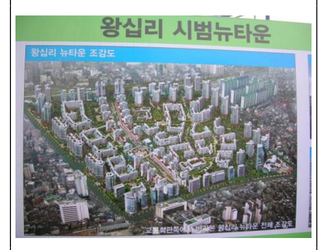
Billboards set up to attract potential buyers of the properties

The stream ends with the final artifact, the Cheonggye Museum in the tube-like transparent architecture (the image of flowing water). Crafted by the most updated museological devices, the museum projects new Seoul in the seamless narrative of the life of the stream flowing from the Chosŏn era up to the present.<sup>28</sup> The celebration of becoming a global city ironically demands an identification with the Chosŏn era. In this sense, the