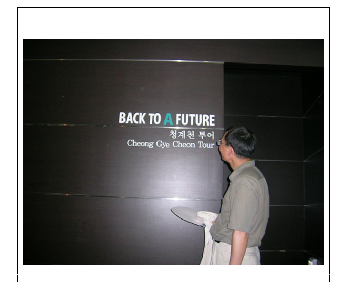
"Back to a future" exhibition in the Cheonggye Museum

By promoting it as the restoration of nature and history which would bring back dynamics to the nation, the government turned the Cheonggye stream into a site of national pedagogy and reminds people of the natural and timeless essence of the nation. As this chapter has examined, the new stream actively invokes the nostalgic pre-colonial past of Choson. In this return to the "authentic" history, the present is imagined as an immediate identification with the distanced past which in turn supersedes the recent pasts, colonial and earlier postcolonial eras. The discourse of "back to a future" (as clearly defined in the Cheonggye Museum) via the new stream provides a conceptual tool with which to equalize differences and neutralize conflicts amid the growing polarization and fragmentation (fig. 13).