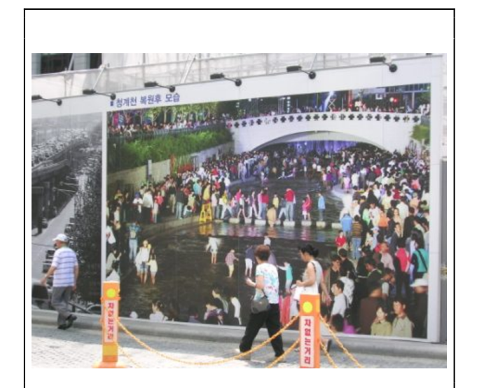
One of the large photographic panel images documenting the life of the Cheonggye stream.

the stream was marked off by three large panels of photographic images which documented the life of the Cheonggye stream. The first panel shows today's urban population enjoying the stream. This image sets up a scene so that passersby and visitors might identify with the citizens of the city and participants of the stream (fig.3). The vivid, colorful scene of people playing with water is a complete contrast with the black-and-white photograph in the second panel. Taken in the 1980s, the photo shows the heavy traffic and cars stuck on the expressway; no human can be seen. The contrast between the first and the second panels provides an angle for viewers to situate their present situation in relation to the recent past. The third image consists of a series of photographs of the stream taken from the colonial time and the era of early decolonization. In this last panel, the stream is shown suffering from flooding, pollution, and neglect.