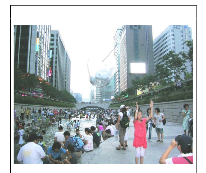
People crowded in the sunken plaza of the Cheonggye stream

unification."<sup>21</sup> People, nature and history are indeed made to meet in the stream.