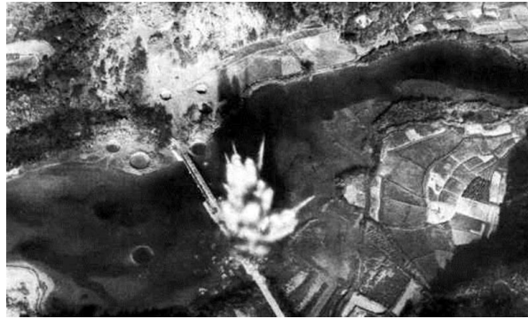
US bombing during the battle

As the carnage continued, in the Headquarters cave at Mabuni on 18 June Ushijima issued his last order, "The battlefield is now in such chaos that all communications have ceased. It is impossible for me to command you. Every man in these fortifications will follow his superior officer's orders and fight to the end for the sake of the motherland. This is my final order. Farewell." To this, his chief of staff, Lt. Gen. Cho added: "Do not suffer the shame of being taken prisoner. You will live for eternity." 51 After urging their troops to "fight to the end," within four days, both the commanders of the 32nd Army, Ushijima and Cho, had taken their own lives, thereby removing the opportunity for the remaining Japanese troops to carry out an organized surrender which would have helped to avoid the final "mopping-up" operations that claimed so many civilian victims. 52