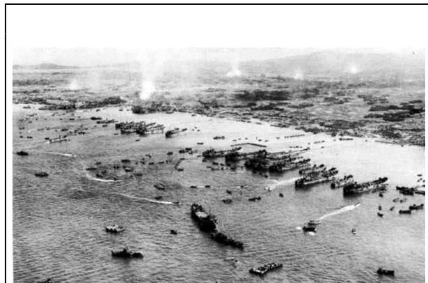
US Marine landing April 1, 1945 (Aerial view)

Early in the morning of 1 April 1945, a fleet of 1,300 vessels landed US forces on the beaches at Chatan and Yomitan either side of the mouth of the Hija River on the west side of central Okinawa. It was the start of fierce fighting that would last three months.