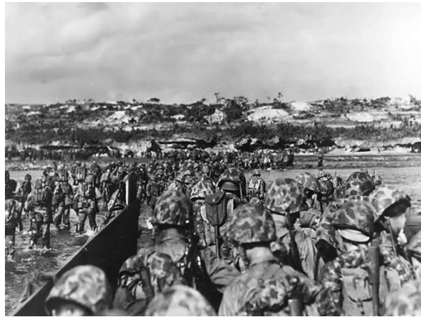
Marine landing April 1, 1945 (ground view)