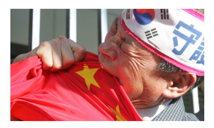
South Korean protester at the Chinese embassy in Seoul, 7 September 2006 (chosun.com)

Needless to say, few people in Korea accepted that these new actions of Chinese researchers were merely the result of academic curiosity, and general outrage followed. Noisy demonstrations took place in front of the Chinese embassy. Some ultra-nationalists even bit, chewed and then burned a Chinese flag in front of the cameras. President Roh decided to raise the issue during the recent summit with the Chinese chief executive, and Korean newspapers of all persuasions ran articles very critical of the Chinese positions. China's actions were widely seen as a unilateral breach of the 2004 agreement.