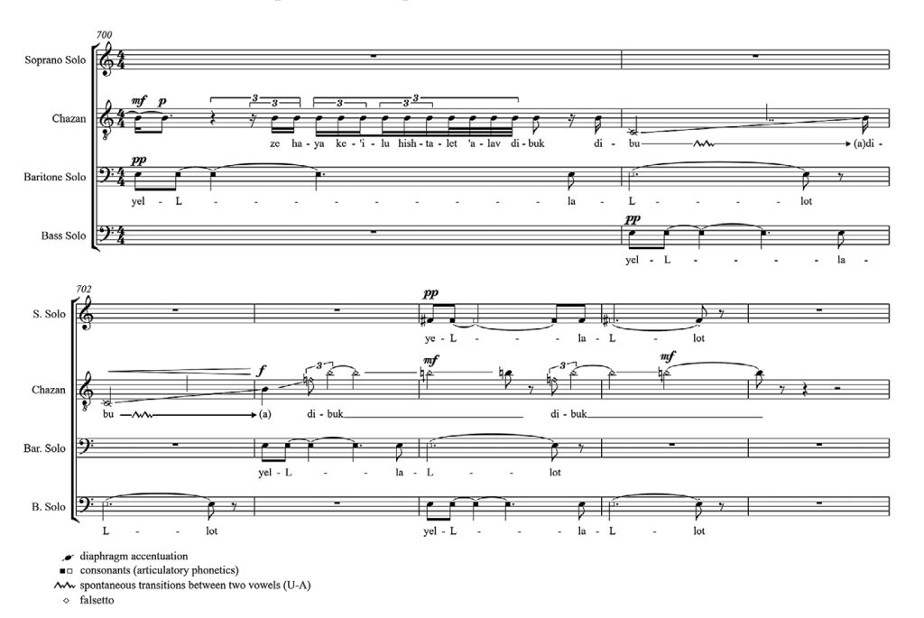
Example 3 'It was like a dybbuk had taken possession of him'. Maor and Levy, The Sleeping Thousand , bars 700–06. Reproduced by permission.

In the midst of the Chazan's 'dybbuk', the other three soloists (soprano, baritone, bass) enter one at a time, forming a small chorus. The chorus utters fragments of the words 'yellalot olal' ('keening of babes') over and over again. The chorus voices the wailing, moaning, and sobbing of possessed children. In scene 4 alone, four words are used to denote different ages of children: toddler (pa'ot), infant (olal), baby (tinok), and child (yeled). It is typical for Yonatan Levy to work with sounds of words, invent conjugations, play with onomatopoeia, and morph words into other words close in sound. With 'yellalot olal' he chooses similar-sounding words for 'keening' (yellalot) and for