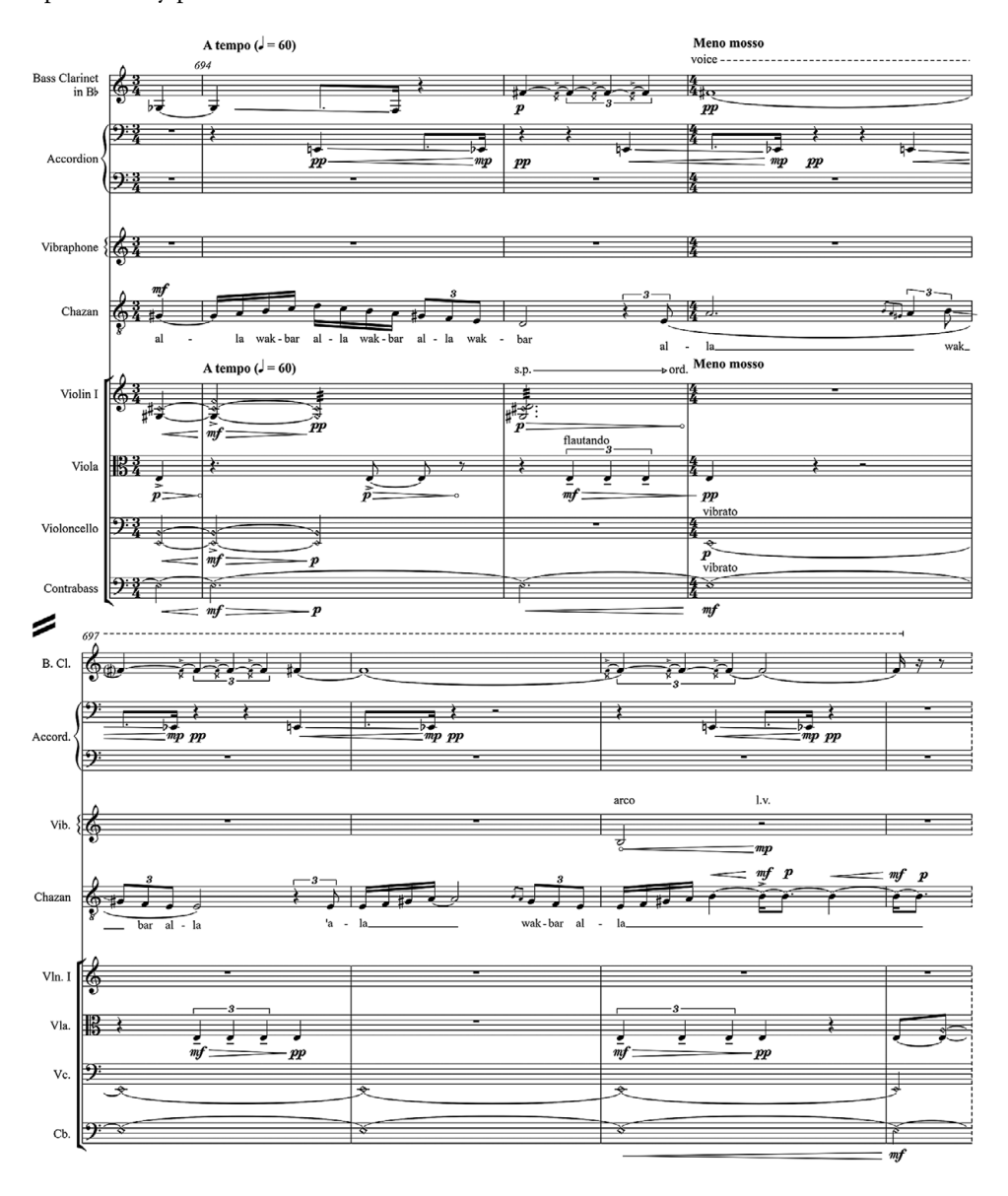
Example 2 Involuntary speaking of Arabic. Maor and Levy, The Sleeping Thousand , bars 694–700. Reproduced by permission.

note, the melodic contour widens; it is scalar and lyrical. The passage is in the Phrygian dominant mode (on E), a scale used in both klezmer music ( ahava raba or frigish ) and Arabic music ( maqam Hijaz or Hijaz Nahawand ). The double reference intertwines Middle Eastern Arab and Eastern-European Jewish sounds. Knotted together, inseparable, these elements make the child a Jewish–Palestinian chimera (Example 2).