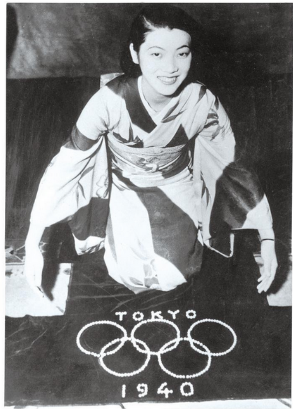
Model poses with strings of pearls arrayed in the Olympic logo.

At the closing ceremonies of the 11th Olympiad in Berlin --- memorialized in Leni Riefenstahl's film "Olympia" --- IOC President Latour announced to the crowd, "It has been decided that the next Olympics, in 1940, will be held in Tokyo."