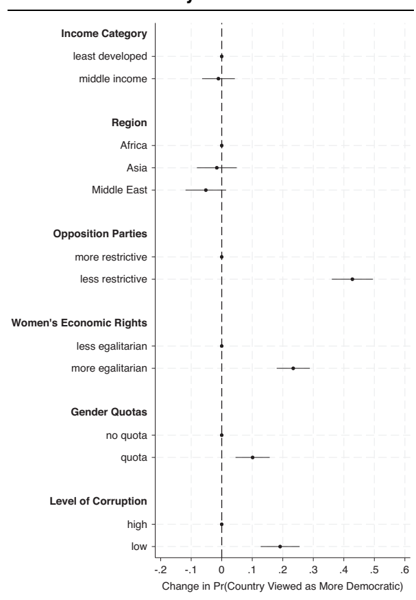
FIGURE 1. Effects of Country Attributes on Perceived Democracy

Note: This figure shows the average marginal component effects with 95% confidence intervals based on regressions with standard errors clustered by respondent. N = 936 . Section 11 of the SM (column 1 of Table A2) contains a table with these results.