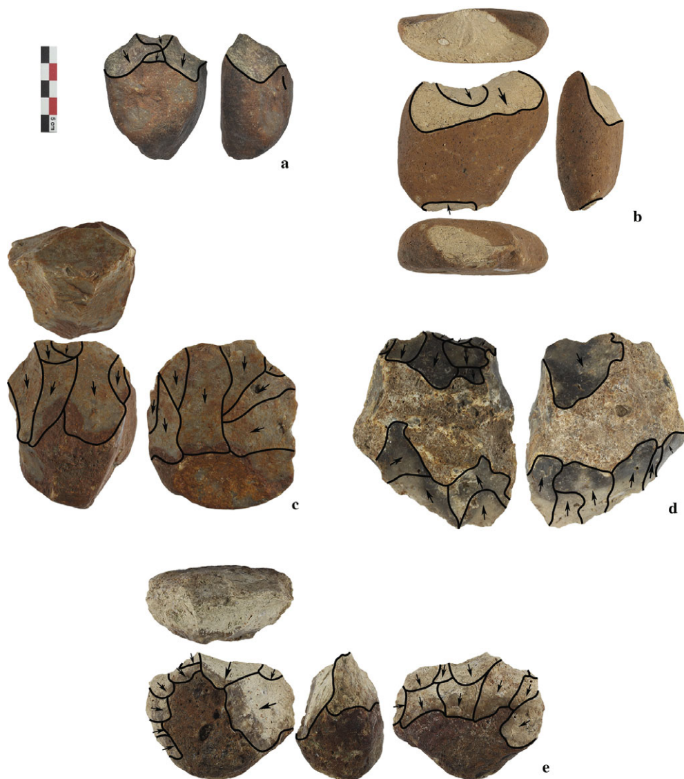
Figure 8. Pebble core tools. a–b) choppers; c–e) chopping tools.

flaked using the recurrent methods. Four examples were made using Levallois lineal methods. Two cores were produced from high-quality grey quartzite, the remainder were made from flint. The final flaking surfaces are prepared by centripetal scars, with a preferential flake removal located at the centre of this surface. The striking platform preparation surfaces were meticulously crafted through centripetal flaking.