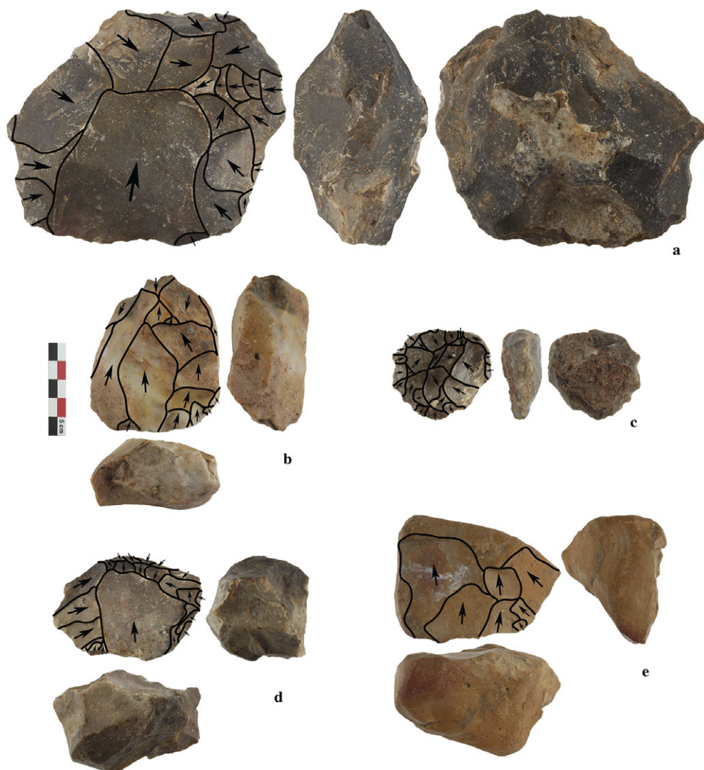
Figure 9. Prepared cores. a) Levallois lineal ; b–c) Levallois recurrent ; d) para-Levallois lineal ; e) para-Levallois recurrent .

orthogonal ( n = 4 ), and unidirectional recurrent ( n = 1 ), based on the orientation of the Levallois products flaked from the final flaking surface.