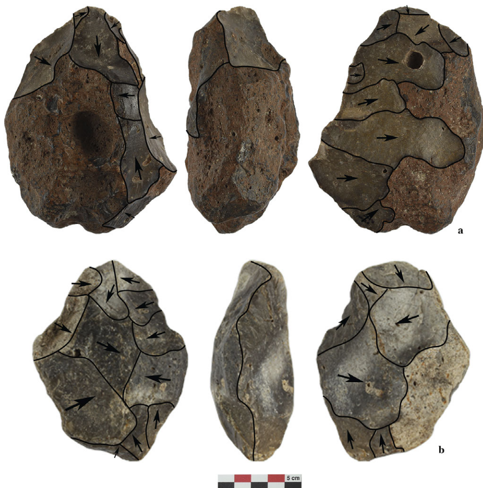
Figure 5. Handaxes. a–b) Abbevillian type.

Trihedral picks are tools manufactured on nodules that have a triangular cross-section, comprising two pieces. The distal end is naturally thick and pointed (Supplementary Material Figure S1.14a). A cleaver is represented by one example (Supplementary Material Figure S1.14b) made on a large flake. The cutting edge is formed by flake removal, and there is no retouch. The width of the cutting edge is more than half the width of the tool. Massive scrapers ( n = 3 ) are made on large flake blanks (see Figure 7a). Shaping is most