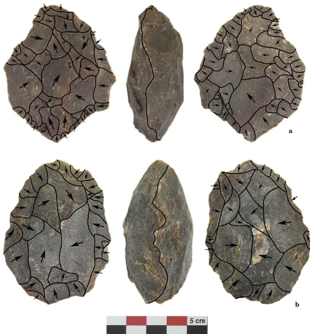
Figure 4. Handaxes. a) cordiform type; b) short-thick almond type.

both lateral sides. Two handaxes are of lageniform shape, i.e. bifaces characterized by a rounded base and a distal end that exhibits a constriction forming a neck with edges that are more or less parallel (Figure 6b); the length ratio of these handaxes is less than 1.5, indicating that they can be classified as short almonds (see Figure 4b). In addition to these, two other handaxes in the assemblage have a different