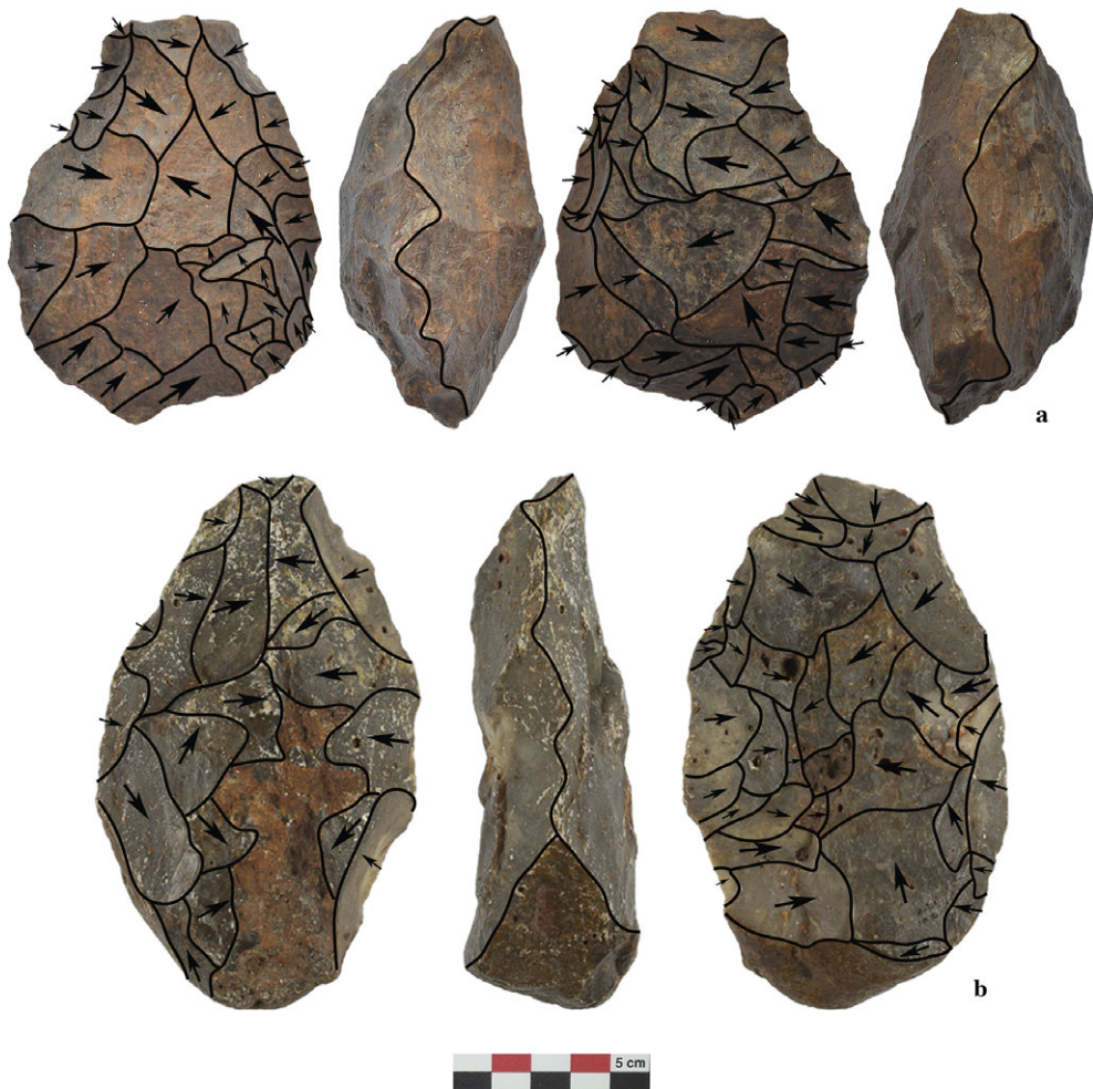
Figure 6. Handaxes. a) Micoquien type; b) lageniform type.

one of quartzite, and the remaining use flint. These tools are characterized by a cutting edge formed by the removal of one or more flakes from a single face (Figure 8a). However, one example is a double chopper, with a cutting edge formed on two opposing edges (Figure 7b). The edge morphologies of these tools can be classified as concave ( n = 2 ), convex ( n = 3 ), or zigzag ( n = 3 ). It is notable that approximately thirty per cent of the tool underwent flaking, while the remaining portions exhibit a cortical structure.