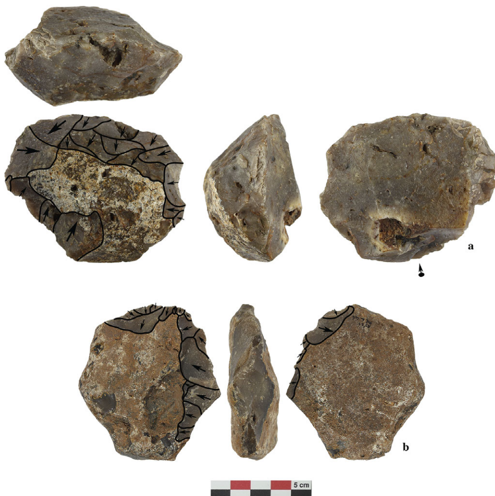
Figure 7. Scrapers. a) massive scraper; b) core scraper.

cortical parts. However, a sample has flaking exceeding fifty per cent, and the flake forming the cutting edge is classified as a core chopping tool due to the depth of the removals. The cutting-edge morphologies of these tools include convex ( n = 5 ), concave ( n = 4 ), S-shaped folds ( n = 5 ), and zigzag shapes ( n = 9 ).