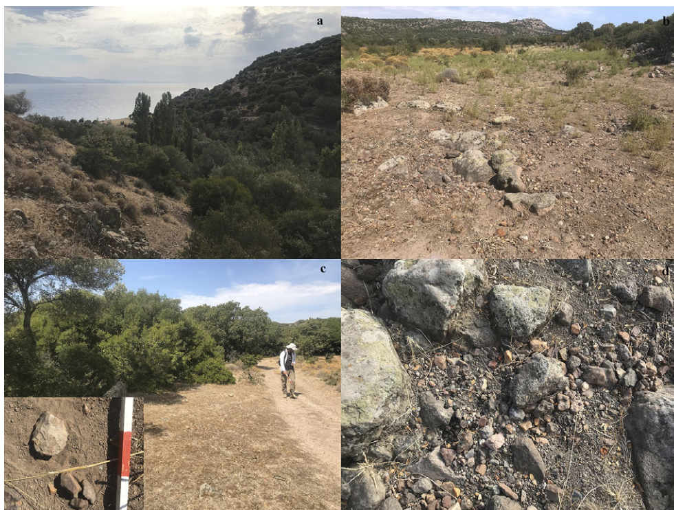
Figure 3. Detailed views of Biber Deresi. a) Biber Deresi basin; b) an eroded area; c) an uneroded area with partially dense vegetation (inset: a distally broken handaxe); d) density of lithics in the eroded area.

landscape in the form of tubers and blocks. In contrast, quartz, quartzite, and limestone are typically observed in surface deposits as small and rounded nodules.