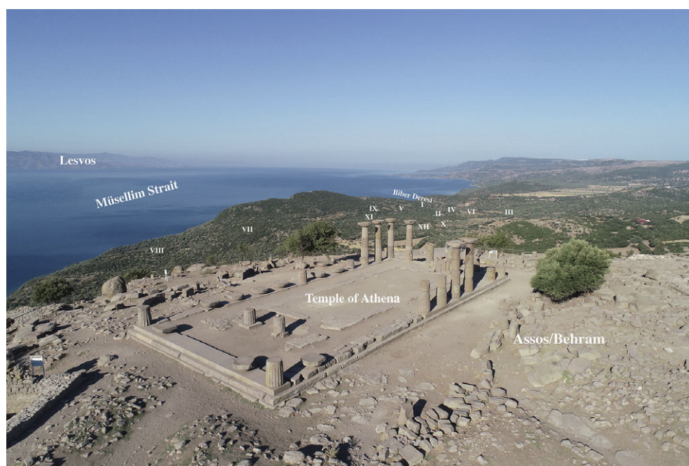
Figure 2. Distribution of Biber Deresi findspots, with the site of Assos in the foreground.

The lithics were recovered from a variety of geographical contexts, including olive groves, low hills, and slopes (Figure 3), with findspots in dense maquis vegetation. In some instances, the area is distinguished by dense forest, particularly along the ridge. Consequently, visibility is restricted. However, lithics have been subjected to significant exposure in specific eroded areas. The findspots are associated with red-brown soils. In some of them, an embankment is situated on top of red agglomerate (volcanic breccia) in the vicinity (see Supplementary Material, Figure S1.2 ). The coastal section of the southern ridge, where the lithics were discovered, slopes down at a considerable angle and is predominantly characterized by rocky terrain rather than coastal features. Despite the absence of lithics in this area, basalt raw material was discernible, particularly in the southwestern portion of the ridge. Flint raw material is widely distributed across the