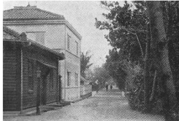
Bonin Island post office and main street

state through such authoritarian apparatuses as government departments, hospitals, schools and prisons. With Japan's modernization, the koseki, as an instrument of surveillance and control, became ubiquitous throughout processes of social administration.