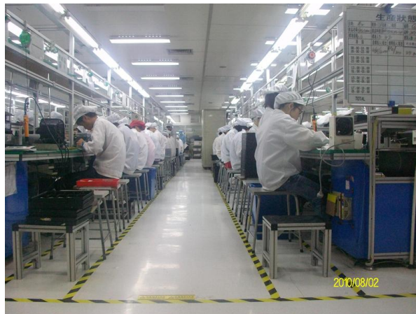
Foxconn assembly line