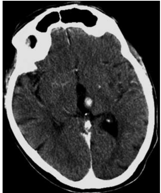
Figure 1: CT brain shows small left thalamic hemorrhage.

A CT brain during the current presentation did not show any acute infarcts or hemorrhage. The MRI brain revealed chronic lacunar infarcts in the gangliocapsular regions bilaterally, and