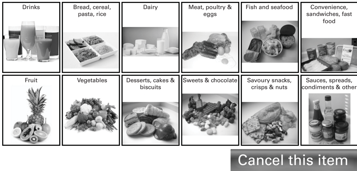
Fig. 2. Screenshot of the Novel Assessment of Nutrition and Ageing (NANA) software high-level food group options.

Minor modifications were made to the NANA dietary software between studies 1 and 3 such as the linking of foods commonly consumed together, and the addition of a ‘favourites’ facility to speed data entry. These changes did not significantly alter the dietary software interface or the user experience. In all the studies, participants were asked to consume their usual diet throughout the duration of the study. Participants were asked at the end of each study whether they had changed their eating behaviour and whether they had forgotten to record any items while using the NANA method.