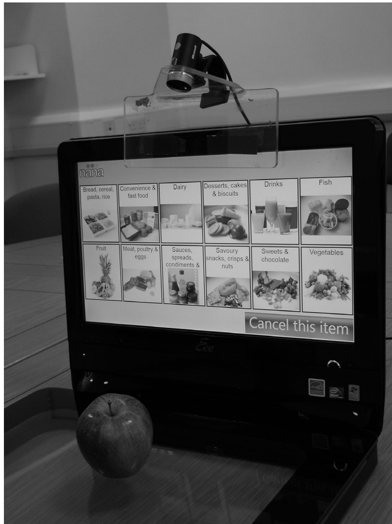
Fig. 1. Image of the Novel Assessment of Nutrition and Ageing (NANA) system.

than the food diary, and only weak-to-moderate associations were observed between nutrient intakes recorded by the 24h MPR method and with both the 4 d estimated food diary and the NANA method (data not shown), and, in addition, no correlations were found between dietary intake and the independent biomarkers of protein and vitamin C intake. From this finding, the 24h MPR was deemed to be a poorer reference method under these circumstances than the 4 d estimated food diary, and it was not used in subsequent studies. The reason for the poorer performance of the 24h MPR compared with the food diary is unknown, but warrants further investigation in future studies.