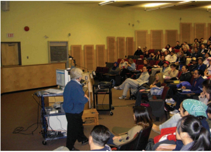
From the front of theatre with the cart

The UBC Bio-Imaging lab is a busy, exciting place in which to work and visit. Researchers come from all over the campus and all over the world to use the equipment and take advantage of the staff expertise, training and advice. The lab has a field emission scanning electron microscope (SEM) that can reach a magnification of 500,000X with a resolution of about 2.5 nm. It also has two transmission electron microscopes (TEM), a variable pressure SEM, as well as three confocal microscopes and all the equipment necessary for specimen preparation, including cryofixation,