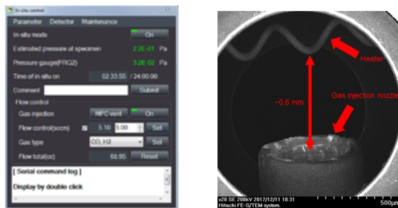
Figure 2. Left: GUI image of “in-situ mode” window to control gas injection and Right: large FOV STEM image of gas injection heating holder (magnification of 20) in the gap of the FE-TEM pole piece.