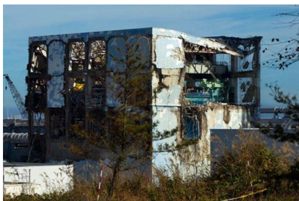
Fukushima Daiichi Reactor No.4, May 2012.

Experts fear that a catastrophe on an even larger scale could still occur. Koide Hiroaki, a nuclear scientist at Kyoto University, warns that Japan 'will be finished' if approximately 300 tons of spent nuclear fuel (4,000 times the size of the Hiroshima atomic bomb) kept at the spent-fuel pool in the badly damaged No. 4 reactor building, release radiation as a result of a cooling failure caused by, for instance, another earthquake. 11 If this happens, the entire Fukushima nuclear complex will become inaccessible, leading to radioactive emissions on a cataclysmic scale, perhaps 85 times as great as Chernobyl. 12 TEPCO reported previously that as of March 2010 there were 1,760 and 1,060 tons of uranium at Fukushima Daiichi and Daini, respectively. 13 A simple calculation, based on Koide's estimate above, suggests that this is equivalent to 28,000 Hiroshima bombs. A 'chain reaction' involving all six reactors and seven spent fuel pools at the complex was envisioned as the 'worst case scenario' by Kondo Shunsuke, Chairman of the Japan Atomic Energy Commission, in his report submitted to the government two weeks after March 11. The report, which was suppressed by the government, concludes that if the 'chain reaction' happens, the exclusion zone may have to be greater than 170km. 14 Tokyo is 220km away from the plant. Kondo's report thus is largely consistent with Koide's prediction, although they hold opposite positions on the question of nuclear power generation.