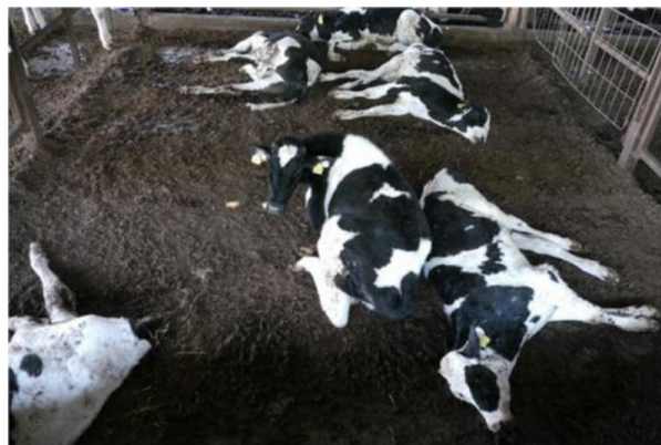
Starving cows in Fukushima

[ Gotagai ] doesn’t mean simply that we humans rely upon each other for our existence but that plants and animals are also partners in this life. Gotagai includes the sea, the mountains, everything. Human beings are part of the circle of gotagai ; we owe our existence to the vast web of interrelationships that constitute life. 64