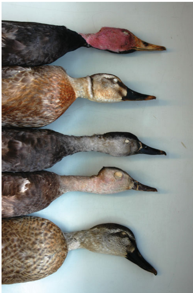
Figure 6. Comparison of heads of (from top to bottom): male Pink-headed Duck; male Spot-billed Duck subspecies zonorhyncha ; female Pink-headed Duck; juvenile male Pink-headed Duck; Spot-billed Duck subspecies zonorhyncha .