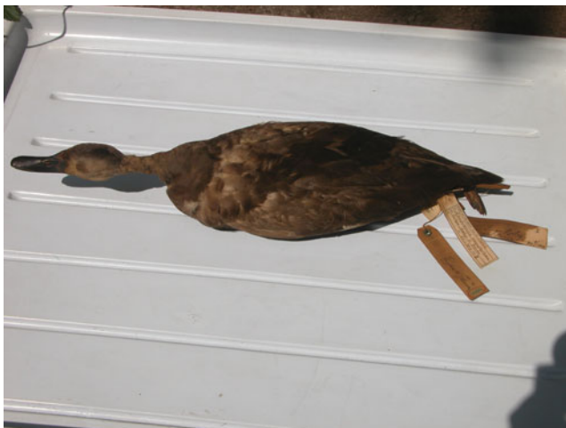
Figure 3. Skin of a female Pink-headed Duck in the collection of BNHS. The specimen was collected at Koolay, near Singu, in present-day Mandalay division, on 25 December 1908.

The second specimen from Myanmar is a male acquired from Mandalay bazaar in February 1910 and held at the American Museum of Natural History (AMNH) (Figure 4). The label of this specimen bears the following information: “♂, Mandalay bazaar, 10.02.10, H. H. Harington”. This represents the last confirmed record of the species from Myanmar. Mandalay ( 21^{\circ}58'30''\text{N} , 96^{\circ}05'00''\text{E} ; 80 m a.s.l.) is c. 60 km south of Singu town.