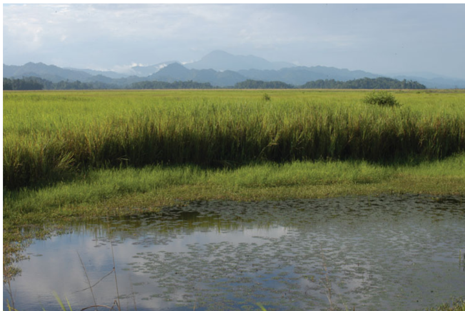
Figure 7. Kamaing area, Kachin State. The photograph shows one of the large grasslands studded with pools near the Nat Kaung river.

On 16 October, the survey team received a report from Poh Sa, a farmer along the Nat Kaung river, who reported that, in September–October 2004, while looking for rubies near Za Baw