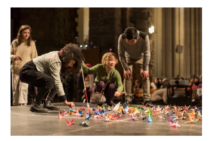
Remembering Fukushima: Art and Conversations at the Cathedral. Audience members placing paper cranes.