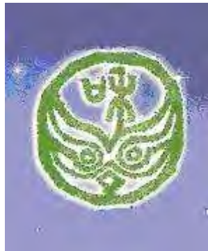
The Symposium Logo

During the preparatory stage of the symposium, all these aspects of the understanding and usage of wakai were extensively debated. The discussion became quite significant while deciding on the logo of the symposium. The initial logo was composed of the character "wa" and an owl, which in Ainu culture is the guardian deity of a village. Concerns were raised about the connotations of the character "wa" and its use within the rhetoric of Japanese imperialism. However, since the character is part of both the words 'reconciliation' and 'peace' ( heiwa ), it was already very 'visible' in the symposium's title. A compromise was reached by using an old-style Chinese form that minimized the association with Japanese imperialism.