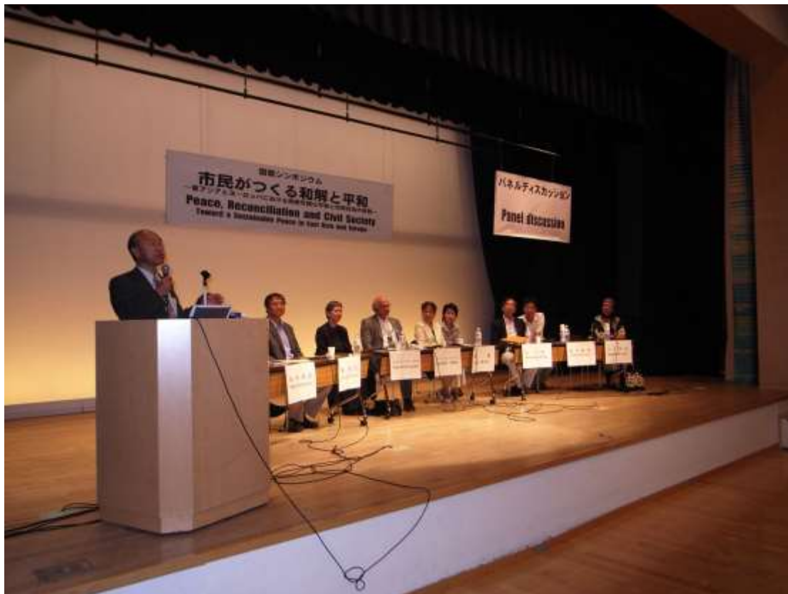
The symposium, panel discussion