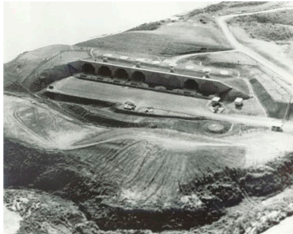
Another of the Mace bases in Kin, Okinawa, is pictured in the early 1960s.

a fratricidal ideological debate over communism's future. However at the time, the Pentagon continued to operate on the assumption that the two countries were allies. This misconception laid the basis of America's infamous blueprint for atomic war the Single Integrated Operational Plan dubbed by one government adviser as a "massive, total, comprehensive, obliterating strategic attack on everything Red." 5 While JFK had made token changes to the plan in early 1962, the amendments apparently hadn't filtered down to the missile control center on Kadena.