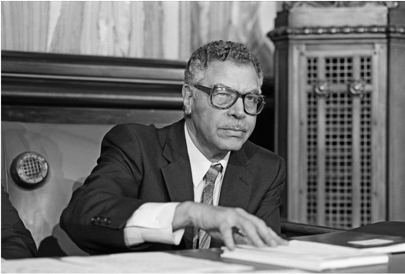
FIGURE 6.2 As Executive Director of the United Nations Environment Programme from 1975 to 1992, the Egyptian scientist Mostafa Tolba played a key role in the promotion of the science and politics of ozone and climate, including the 1985 Vienna Convention for the Protection of the Ozone Layer and the establishment of the Intergovernmental Panel on Climate Change in 1988.