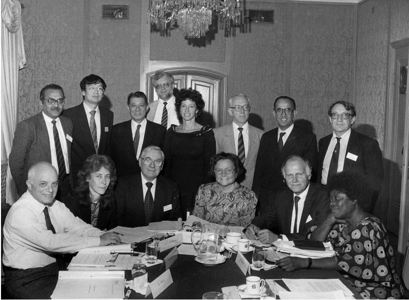
FIGURE 6.6 First board meeting in September 1989 of the Stockholm Environment Institute, which has since its establishment consistently ranked as one of the world's top environmental think tanks. Most of the original staff and leadership of the Institute, as well as the network of SEI satellite centers outside Sweden, were inherited from the original Beijer Institute.

left the Academy for new premises in Stockholm's Old Town, SEI also absorbed the Beijer Institute's international network, including its centers in York and Boston. Since the establishment of SEI, new centers and satellite offices have been opened in Tallinn, Bangkok, Bogotá, Nairobi, Oxford, Seattle, and Davis, California.