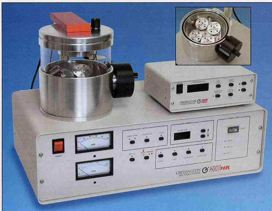
High Resolution Sputter Coater 208HR shown with Rotary-Planetary-Tilting Stage and Thickness Controller MTM-20 The Cressington 208HR offers the most sophisticated features in it's class, at an outstanding value