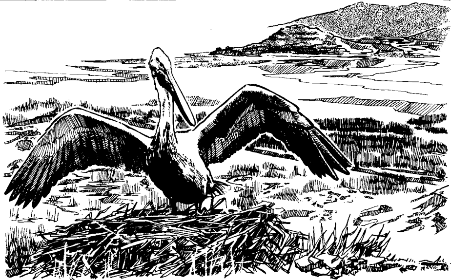
Dalmatian pelican Pelecanus crispus , one of two species of pelican which nest at Lake Mikri Prespa National Park in northern Greece.

on the role of national parks in Western Europe. The author is realistic rather than sentimental about conservation, very much in tune with the philosophy of the World Conservation Strategy. I have two small complaints. He ought to have said more about the vital part played by the staff of the national parks, especially the field staff of rangers and wardens. And there is a misunderstanding about the role of IUCN's Commission on National Parks and Protected Areas: it is not responsible for the Red Data Books of endangered species, as readers of Oryx will surely know.