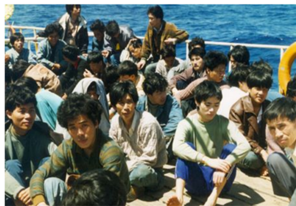
Fujian undocumented migrants on the deck of a fishing boat.

Accompanying payment for the visa, there were also extra costs was associated with pooling money. Only a few families already had members working abroad and therefore could afford the initial costs. Most immigrant families borrowed at high interest (usually 1 percent every month) or obtained loans through rotating credit associations. Many Fujian students had to quit school and become visa-overstayers because of the financial burden.