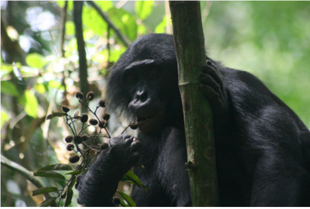
PLATE 1 Bonobo Pan paniscus eating velvet tamarind fruits ( Dialium sp.) and swallowing seeds at LuiKotale, Democratic Republic of Congo.